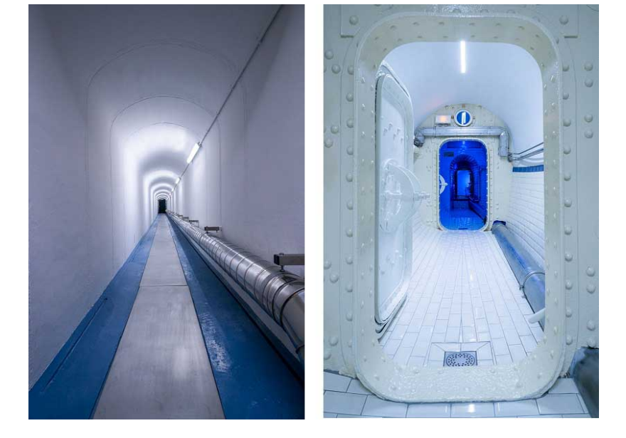
Figure 4. The Cachat spring in Evian-les-Bains. Left: access gallery. Right: end part of the capture access gallery.

It is exclusively of underground origin , collected either from a spring (a natural outlet of groundwater; Figure 4) or by drilling (a well, generally vertical, to reach the rock containing the groundwater - the aquifer - and pump it out). Thus, surface water (water collected from a river or lake, for example) cannot be bottled as natural mineral water (nor as spring water; it can only be bottled in France under the name of "water made potable by treatment");