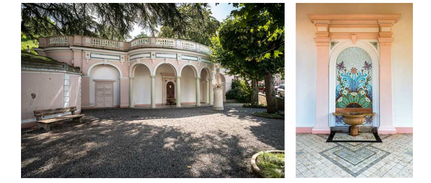
Figure 1. The Cachat bar in Evian-les-Bains continuously delivers Evian natural mineral water to the public.

In France, interest in thermal waters continued in the Middle Ages. All the thermal springs were even transformed into State property in 1549 with the letters patent signed by Henry II.[1]. In 1605, Henry IV introduced the first state controls on the thermal and medicinal waters of the kingdom by creating the Superintendence of Mineral Waters. This State property being little respected by many landowners who privately exploit the water gushing out of their lands, Louis XV, while confirming this right in 1772, nevertheless recognizes that of the owners of the land on which springs gush. This problem was definitively resolved in 1781 by a decision of the Conseil d'Etat, which distinguished between sources belonging to the State and those present on the properties of individuals that they could exploit after authorization by the Royal Society of Medicine and subject to compliance with the regulations in force.