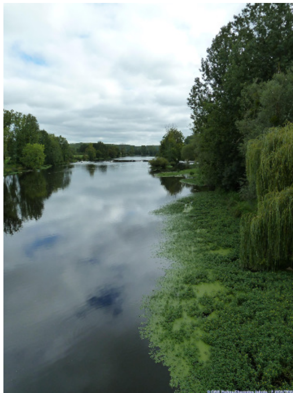
Figure 4. La Vienne in Lussac-les-Châteaux (86) on 15/08/2011. The development of increasingly important and constraining invasive species in the surface buckets, most probably due to the increase in water temperature and nutrient inputs.

Moreover, at constant quality and quantity of anthropogenic discharges, the effect of less dilution of pollution, coupled with a probable remobilization of pollutants already present in sediments, will lead to an increase in organic and mineral micro-pollution. The question of the quality of the resource for drinking water supply from surface water will also arise, especially when this resource is the only one available. What barriers can be considered to satisfy the likely increase in "raw water" of certain quality parameters such as parasites, cyanotoxins, natural organic carbon (precursor of toxic disinfection by-products), micropollutants, etc.? The development of energy-intensive technologies and the more systematic use of chemical reagents for the treatment of water to be "potabilized" are of course curative solutions to these problems of degraded raw water, but at what costs and with what effects?