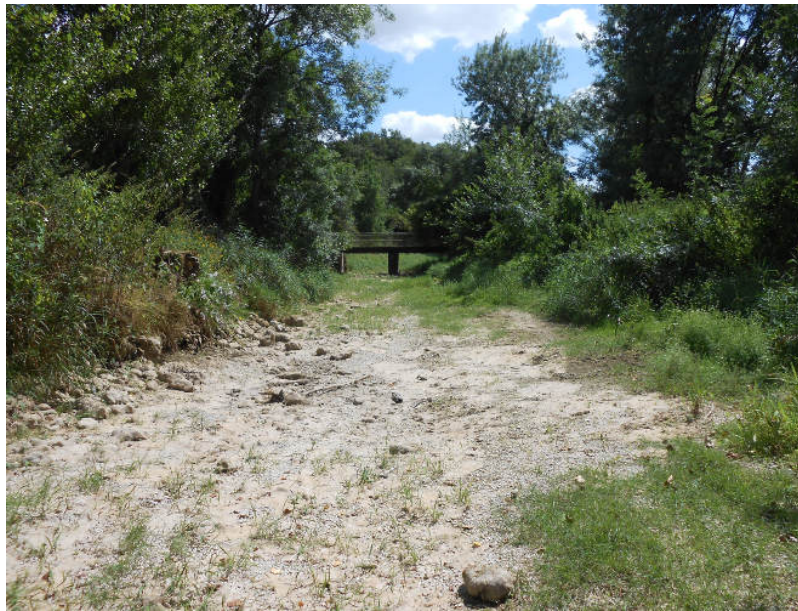
Figure 3. La Dive du Sud in Couhé (86), 30/07/2015. Increasingly frequent and long dry spells under the impact of climate change.

Current scientific evidence [4] shows that climate change, already at work in France, will have significant and alarming consequences on resources for some particularly affected geographical areas. This is the case, for example, in the great southwest of France, for which projections over 2050 predict an average decrease in natural river flows of 20 to 40% and a decrease in groundwater recharge of 30 to 55%. It is therefore possible to envisage scarcity of the available resource, particularly during episodes of extreme heat and drought and, as a result, an increase in conflicts of use and over-consumption of drinking water (see § 2).