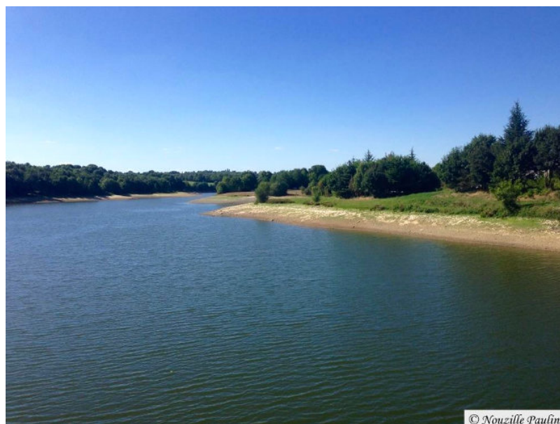
Figure 1 (Barrage de la Touche Poupard (79) on 21/08/2016). It is from the reservoir water that the production of drinking water is the most delicate.

increase in population and global warming, a considerable challenge, especially for countries with less than 1,000 m 3 per capita of renewable fresh water [1] (see Risk of water shortage? ). France has 2,600 m 3 of renewable fresh water per inhabitant, with wide geographical and seasonal disparities. This corresponds to a total of 170 to 175 billion m 3 , of which 5.4 billion m 3 (5.4 km 3 ) are withdrawn for human consumption, slightly less than 2/3 of which is groundwater and the rest surface water.