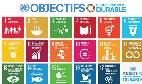
Figure 2. The 17 Sustainable Development Goals (SDOs) of the UN Sustainable Development Programme by 2030.

Sustainable development is a field of questions and problems where many academic works are positioned [8]. However, in recent years, there has been a certain loss of influence of this concept at the national and local levels as well as in the militant demands that had been raised during the 1990s and 2000s. At the UN level, however, the reference remains preminent since it was reaffirmed in 2015 in the context of the "Sustainable Development Goals" (2015-2030) that succeeded the "Millennium Development Goals" (2000-2015), which were crucial development objectives in a North-South context. Under discussion, the "Sustainable Development Goals", which are now valid for all countries, do not have a particular focus on the environment, reflecting the shift over the years towards a broader approach to development.