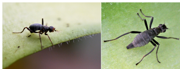
Figure 3. Wingless fly, Calycopteryx moseley, living in the Kerguelen Islands, in an extremely windy environment.

A genetic mutation is not inherently advantageous or disadvantageous , depending on the environment. For example, in the Kerguelen Islands, in the subantarctic, there is a wingless fly species, Calycopteryx moseley (Figure 3). This character, strongly disadvantageous in our regions, is on the contrary beneficial there because it prevents these flies from being carried into the ocean by the very strong winds that constantly sweep these islands.