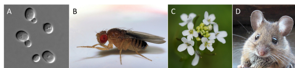
Figure 2. Examples of model organisms used in genetics. A, Baker's yeast. B, Drosophila. C, Thale cress. D, Mouse

A first type of regulation depends on the number of lesions in the cell . This phenomenon was first highlighted in the colibacillus ( Escherichia coli ), a bacterium that is one of the preferred subjects of study for geneticists. As early as 1974, it was assumed that there was a response, called SOS [2], which regulates the intervention of several repair systems according to the number of injuries. When there is a small number of lesions, this response increases the effectiveness of faithful repair mechanisms . But beyond a certain threshold of damage, these mechanisms are overwhelmed. The SOS response then induces the synthesis of a replicase able to cross specific lesions (see below), but with a certain error rate. This is called SOS mutagenesis . At the end of the 1990s, it was shown to facilitate the adaptation of the bacterial population to a hostile environment, at the cost of significant losses due to harmful mutations. It is a kind of last chance, hence the name SOS.