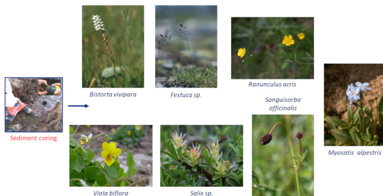
Figure 2. Paleo-environment reconstruction from permafrost (South Chukotka, Russia). Collection of sediment samples and main species identified by metabarcoding

Once the DNA barcode has been defined, it is used to identify all the species present in an environmental sample according to the following process (Figure 1):