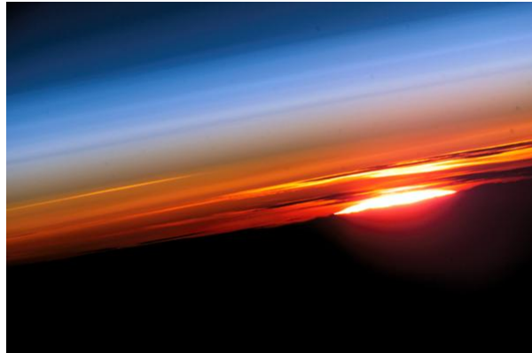
Figure 1. A sunrise seen from the International Space Station. The homosphere is characterized by the lower layer, reddish in the rising sun, and the blue layer, corresponding to the stratosphere.

What are the physical characteristics of this atmospheric layer? Pressure and density decrease as a function of altitude according to an exponential law (see The atmosphere and the Earth's gaseous envelope ). As we go upward, the temperature decreases linearly in the troposphere, from 6 to 7 degrees per kilometre. The latter value is highly dependent on the relative humidity level of the air.