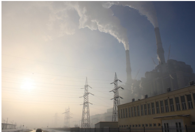
Figure 4. The main industries in and around Huolin Gol (coal, energy and chemicals) have polluted the grasslands to such an extent that herds can no longer graze on them. The local community has installed sculptures in place of the animals.

The Minamata Convention incorporates fairly strong legally binding measures. For example, as long as it comes into force, no new mercury mining activities can be undertaken. Existing mining activities can continue, but only for a limited period of fifteen years [8] . It is hoped that in a few years no more mercury mines will be in operation.