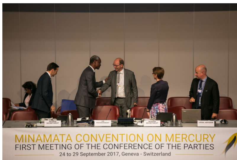
Figure 5. Marc Chardonens, Director, Federal Office for the Environment, Switzerland, is welcomed onto the podium after being elected COP1 President

The Minamata Convention, like the vast majority of environmental conventions, establishes a Conference of the Parties (COP) (Figure 5). It is an assembly that takes decisions at regular intervals, mainly on the implementation of the Convention . Only States that have undertaken to comply with the Convention have the right to vote and decisions are generally taken by consensus. However, other States, NGOs and the private sector are admitted as observers and may speak during the negotiations, without the right to vote. Decisions rendered may also concern aspects that could not be settled at the time of signing the agreement due to lack of consensus or time during negotiation meetings.