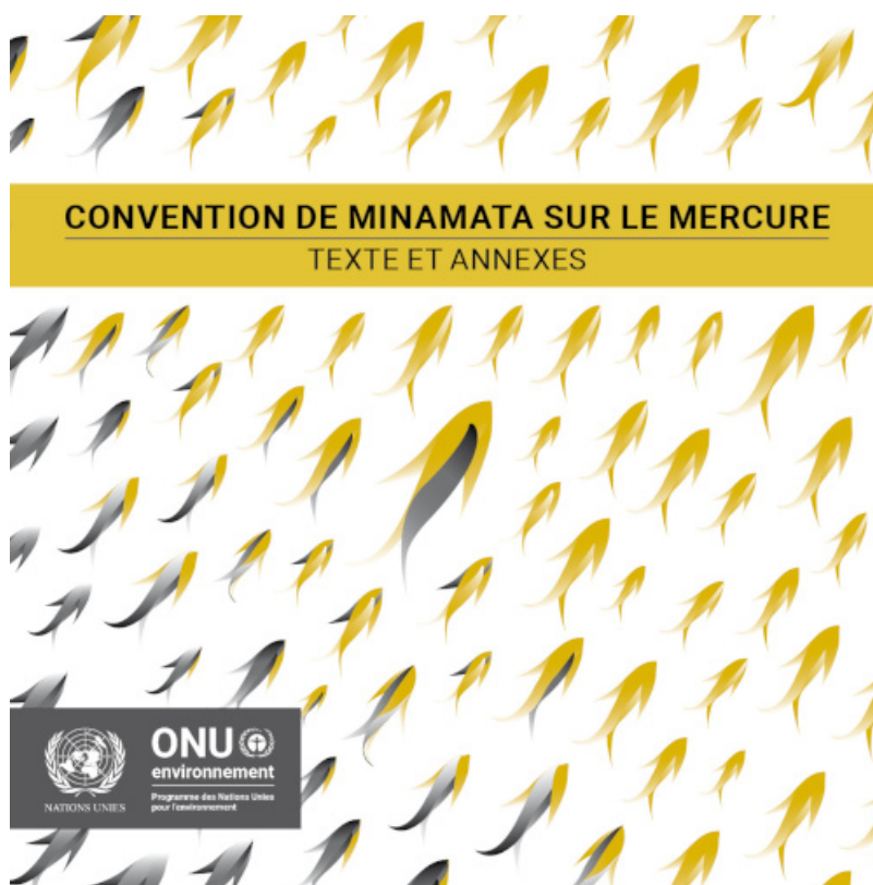
Figure 2. The Minamata Convention, edition prepared for COP-1

Mercury is a natural element that can be dangerous to health and the environment [1]. For this reason, its use is subject to restrictions and bans in many countries. For example, dental amalgams are banned in the European Union for minors under fifteen years of age and pregnant women, who are particularly vulnerable to the effects of mercury [2].