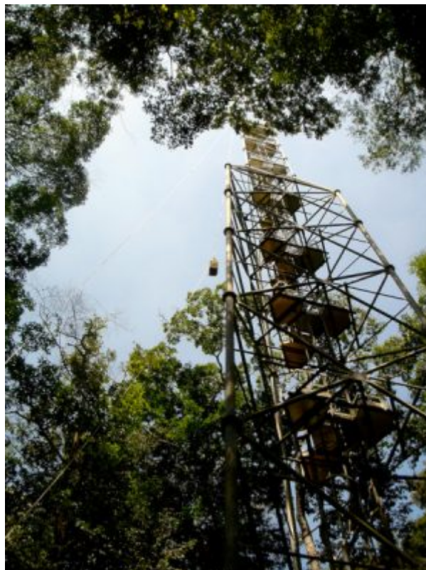
Figure 2. Flow tower to measure the gas exchange between the forest and the atmosphere (Paracou site in French Guiana). In the same area, ground-based sensors have been installed to assess GHG emissions, including NOx.

Such a tower, part of the Amazonian subnetwork, has been installed in Paracou (Figure 2) [8]. COPAS, on the other hand, allows access to the interior of the canopy and the observation and sampling of this particular ecosystem, in particular the living beings, animals, plants and microorganisms that inhabit it.