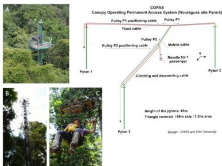
Figure 1. COPAS (Canopy Observatory Permanent Access System) device at the Nouragues station in French Guiana: each of the three pylons constituting the system is instrumented and has at its top a balcony allowing to observe the canopy (A), a pylon (B), and the nacelle during a test by a researcher (C).

In French Guiana, COPAS (Canopy Observatory Permanent Access System) [4] is an illustration of the systems used to study the canopy. This initiative was preceded by aerial tests, including the "canopy raft", and is now supplemented by the use of drones [6]. In addition, conventional, instrumented air assets are widely used (aircraft and helicopters), as are satellite assets.