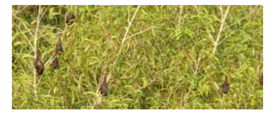
Figure 3. Dormitory of the black dogfish (Pteropus niger) in eastern Reunion Island. The black dogfish recolonized Reunion Island from Mauritius in the early 2000s about two centuries after it had disappeared.

Figure 3. Roost of the Mauritian flying fox ( Pteropus niger ) in eastern Reunion Island. The Mauritian flying fox recolonized Reunion Island from Mauritius in the early 2000s about two centuries after it had disappeared.