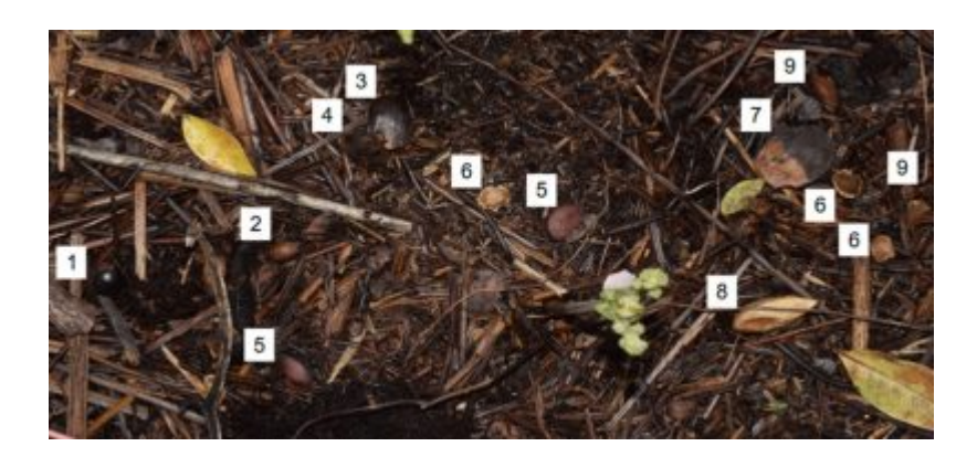
Figure 1: Direct sowing of large-seeded trees in December 2021 in one of the ECOFORRUN project plots. This project aims to restore tropical rainforest by combining invasive plant control with direct sowing. These 9 species are: 1, Strongylodon lucens (Fabaceae), 2, Hyophorbe indica (Arecaceae), 3, Mimusops balata (Sapotaceae), 4, Hernandia mascarenensis (Hernandiaceae), 5, Diospyros borbonica (Ebenaceae), 6, Terminalia bentzoe (Combretaceae), 7, Pandanus purpurascens (Pandanaceae), 8, Ochrosia borbonica (Apocynaceae), 9, Cassine orientalis (Celastraceae).

In Reunion Island, experimental sowings have shown that it is possible to restore the recruitment of various woody plants with large fleshy fruits on historical lava flows (see Figure 9, article How vertebrate extinctions threaten tropical forests ). These experiments also tested the impact of other limitations such as seed predation by rats or competition with invasive plants. These experiments showed that the loss of dispersal due to the disappearance of frugivores is the main factor explaining such a depletion of native woody diversity. [1].