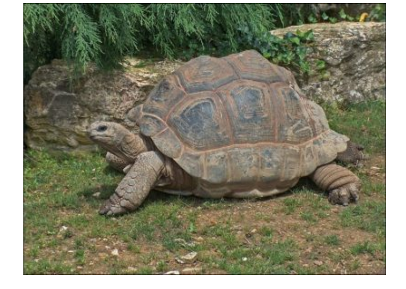
Figure 2. Giant Seychelles tortoise (Aldabrachelys gigantea)

The exotic land tortoises Aldabrachelys gigantea (Figure 2) and Astrochelys radiata are considered to be good functional analogues of the extinct Cylindraspis spp. tortoises in the Mascarenes [3]. They have been successfully used in various ecological restoration projects in the archipelago. However, it is easier to rewild the islets of Mauritius with these tortoises than the native habitats of Reunion Island: these islets are isolated nature reserves, while the problems of securing the animals are paramount in Reunion Island where poaching is to be feared.