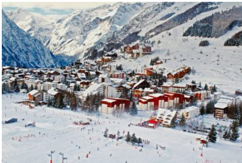
Figure 2. Lifts, slopes and tourist real estate.

Their creation is the responsibility of either local urban planning documents (UTNS by territorial coherence schemes, UTNL by local urban planning plans) or, in their absence, the State (a decree of the prefect). Once authorized or planned, municipalities or inter-municipalities may issue or request the issuance to the State of the authorizations required under various parallel legislations: deforestation, construction or development, installation of ski lifts, runway construction or water withdrawal [3] .