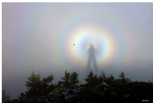
Figure 1. Brocken's spectrum of the photographer with glory.

On board an aircraft or at the top of a mountain, it is sometimes possible to observe on fog or clouds the shadow of this aircraft, or an object such as a cross, or the shadow of the observer himself. It's a Brocken spectrum. This shadow is sometimes surrounded by a coloured light circle similar to a rainbow; we are then confronted with a Brocken spectrum with glory or anthelion (see Atmospheric Halos ). This relatively rare appearance, at the origin of beliefs in supernatural phenomena or superstitions, was the subject of a poetic narration by Baudelaire in Les Paradis artificiels .