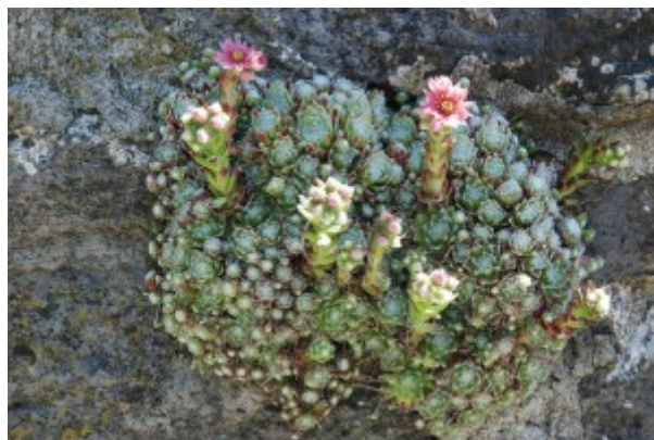
Figure 1. Cobweb house-leek ( Sempervivum arachnoideum L.).