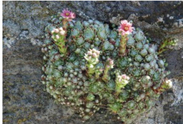
Figure 1. Cobweb house-leek ( Sempervivum arachnoideum L.).