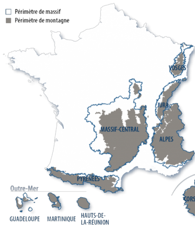
Figure 2. Map of the French massifs

It should be noted that, in addition to mountain areas qualified as such in the administrative sense, there are also "massifs" which are recognised in law. They even have a specific body with the "committees of massifs" whose missions to promote sustainable development are multiple: drafting of an inter-regional plan for the planning and development of the massif, opinions given during tourist development operations) [8]. Delimited by decree, the massif is a larger area that includes mountain areas but also areas that are immediately adjacent to them: foothills or plains (Figure 2). According to article 5 of the Mountain Law, the massifs are: Alps, Corsica, Massif Central, Jura Massif, Pyrenees, Vosges Massif.