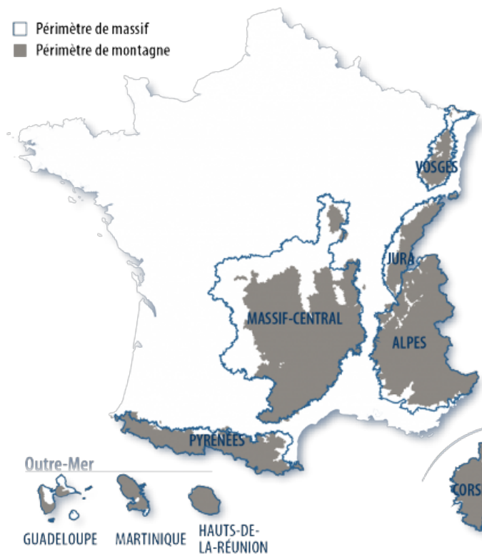
Figure 2. Map of the French massifs

It should be noted that, in addition to mountain areas qualified as such in the administrative sense, there are also "massifs" which are recognised in law. They even have a specific body with the "committees of massifs" whose missions to promote sustainable development are multiple: drafting of an inter-regional plan for the planning and development of the massif, opinions given during tourist development operations) [8]. Delimited by decree, the massif is a larger area that includes mountain areas but also areas that are immediately adjacent to them: foothills or plains (Figure 2). According to article 5 of the Mountain Law, the massifs are: Alps, Corsica, Massif Central, Jura Massif, Pyrenees, Vosges Massif.