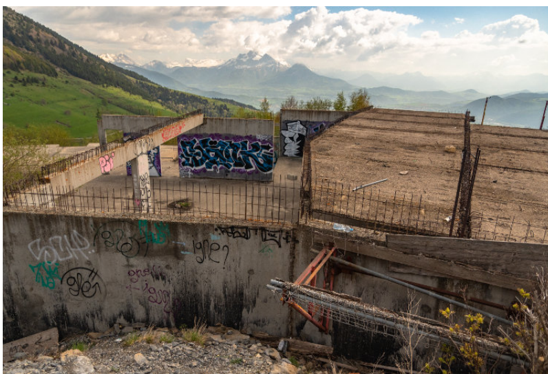
Figure 10. Ghost ski resort of Saint Honoré 1500. At the end of the 1980s, the station's project was launched to revive the local economy after the closure of the La Mure mines. Houses and ski lifts were created. But financial malpractice stopped the real estate project with a judicial liquidation in 1995. As the snow cover of the area is increasingly lacking, the ski resort will be closed in 2004. The lifts will then be dismantled and resold. Next to inhabited buildings, abandoned buildings are still for some time the realm of graffiti artists.