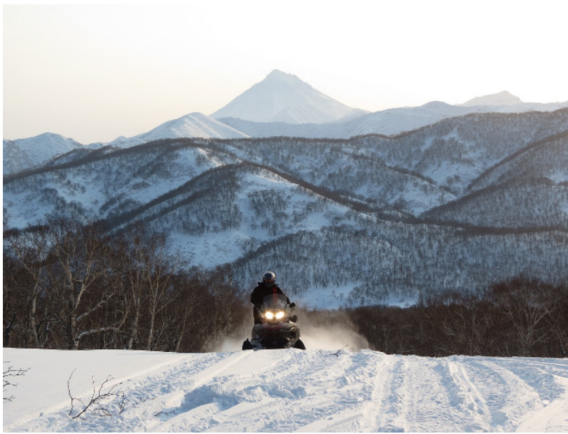
Figure 9. Snowmobile.

Snowmobiles are considered motor vehicles [31] and therefore, in theory, their circulation is very restricted (Figure 9). However, the increasing use of these devices for the benefit of tourists has led the legislator to build a regime that allows their use in the natural environment while limiting, if possible, their impact on the environment, public tranquility or safety. It prohibits the creation of itineraries in natural environments, even marked out , for the practice of sports or motorized leisure activities. On the other hand, they can be used on land specially designed for their use . If the area exceeds 4 hectares, these lands are also subject to the UTN procedure (Focus # 2). It is absolutely essential to be in the presence of a "land" and not a "route", otherwise the project is illegal [32].