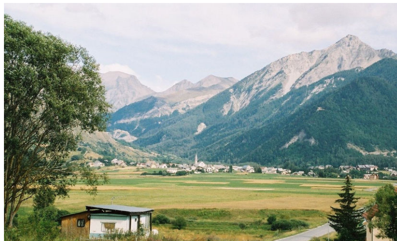
Figure 3. Lachaup Plain, Ancelle and Piolit (Highlands)

In the mountains, the urban planning code requires that the land necessary for the maintenance and development of agricultural, pastoral and forestry activities , particularly the land located in the valley bottoms, be preserved (Figure 3). The need to preserve these lands is assessed in the light of their role and place in local farming systems. Their situation in relation to the location of the farm, their relief, their slope and their exposure are also taken into account [12].