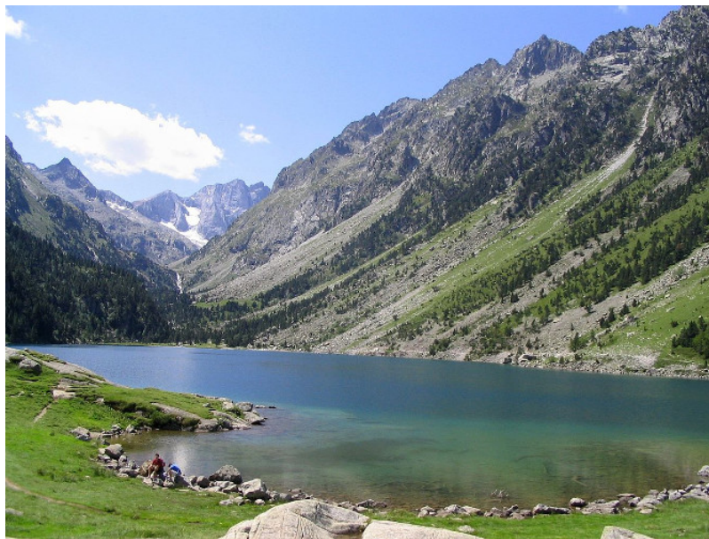
Figure 4. Gaube Lake (Cauterets Valley, Pyrenees) View of the lake in summer with the Vignemale at the bottom.

In the mountains, the natural parts of the banks of natural or artificial water bodies with an area of less than 1,000 hectares [16] are protected over a distance of 300 metres from the shore (Figure 4). All new constructions, installations and roads are prohibited , as well as all extraction and scouring [17]. However, a large number of exceptions or derogations allow construction under restrictive conditions (in particular refuges, stopovers, natural camping areas, reception and safety equipment necessary for swimming, water sports, walking or hiking) [18].