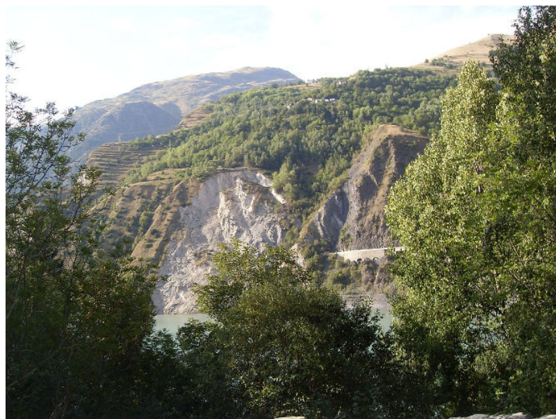
Figure 7. Landslide of Chambon, August 2016.

Many legal tools have been created to prevent natural risks and keep buildings away from hazards. For example, and in the first instance, the mayor or prefect may refuse to authorize construction projects on grounds of public safety [26]. Then, the local urban planning plan can prohibit construction in areas at risk and classify the parcels concerned as natural areas.