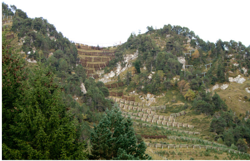
Figure 8. Security work carried out by the RTM service in the Mongie national forest (near the Pic du Midi de Bigorre).

Despite the voluntarism, the pressure for development being such, we must also resolve to "learn to live" with the natural risk . Thus, when prevention seems economically or socially out of reach, the consequences or effects of accidents should be limited by measures to protect property and people. It will be a question of assuming the risk . Where prevention is intended to prevent accidents from occurring, protection includes this possibility.