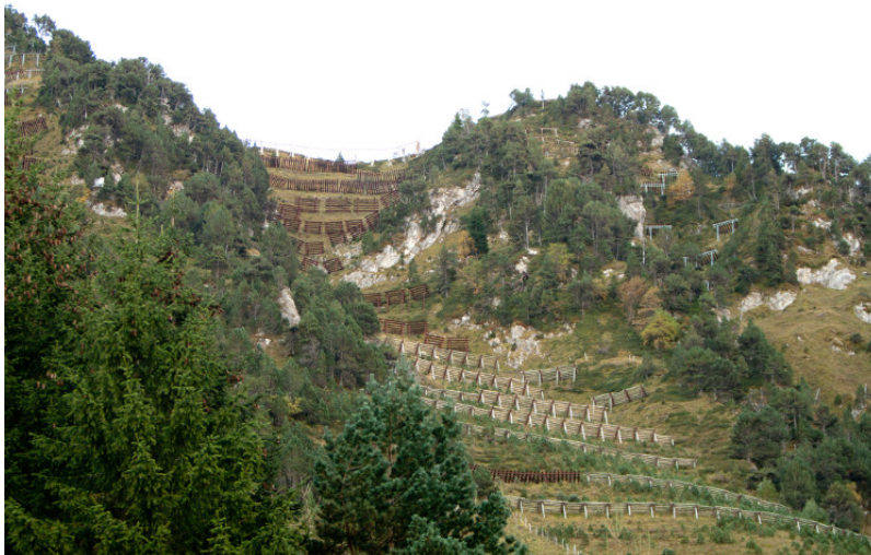
Figure 8. Security work carried out by the RTM service in the Mongie national forest (near the Pic du Midi de Bigorre).

Despite the voluntarism, the pressure for development being such, we must also resolve to "learn to live" with the natural risk . Thus, when prevention seems economically or socially out of reach, the consequences or effects of accidents should be limited by measures to protect property and people. It will be a question of assuming the risk . Where prevention is intended to prevent accidents from occurring, protection includes this possibility.