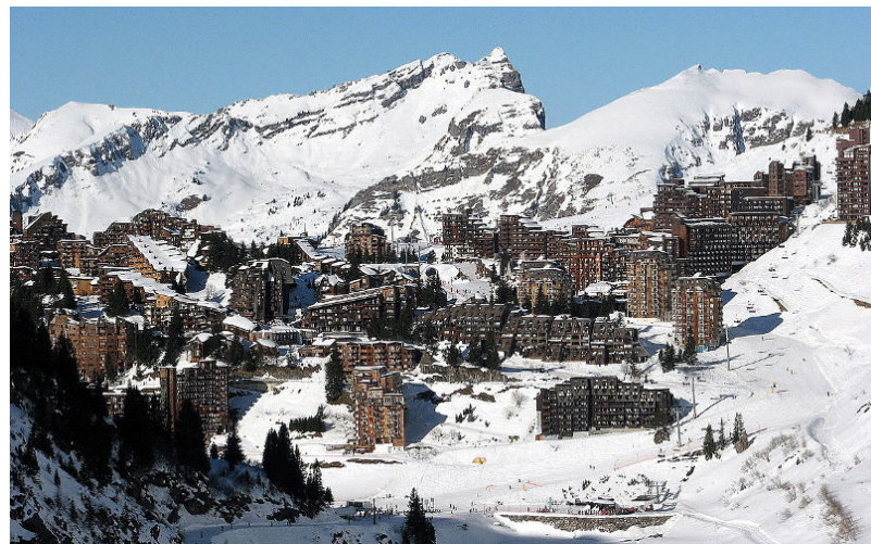
Figure 1. The development of mountain ski resorts: Avoriaz.

Environmental protection has been a commitment of governments since the early 1970s. Since then, the consideration of nature has only increased with, in particular, Act No. 76-629 of 10 July 1976 on the protection of nature, and much later, Constitutional Act No. 2005-205 of 1 March 2005 on the Environmental Charter.