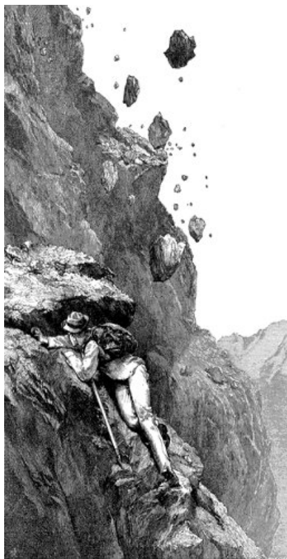
Figure 6. Edouard Whymper's engraving "Une canonnade dans le Cervin" from Edward Whymper's book "Escalades dans les Alpes de 1860 à 1869" (p. 135); Paris: Hachette, 1873. Collection: Chambéry Municipal Library.

In people's minds, the mountain is often perceived as a space conducive to accidents (Figure 6). As such, it is closely associated with the notion of danger or risk, even if a part of fantasy accompanies reality. The question of taking natural risks into account is all the more serious and topical as global warming has the consequence of making mountains both more accessible (in particular, they can be built at higher altitudes) and more dangerous (soil instability, etc., see the "Natural Risks" section of the Encyclopedia of the Environment ).