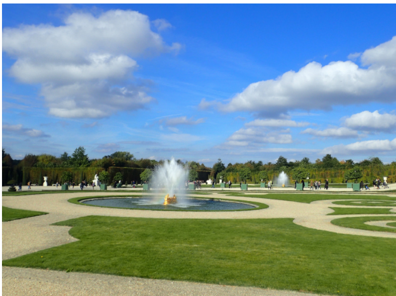
Figure 6. Park of the Palace of Versailles, illustrating the concept of locus amoenus .