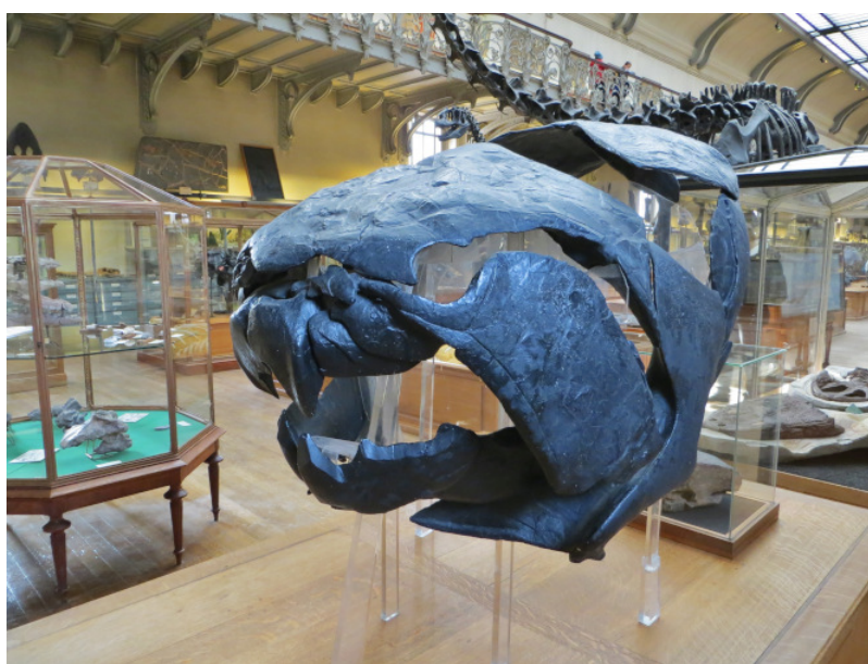
Figure 8. Devonian placoderm fossil (MNHN).

The idea of nature underwent a revolution in the 18 th century: Westerners then finished mapping the entire planet , which suddenly seemed surprisingly small. At the same time, explorers gave an idea of the spatial distribution of the different species,