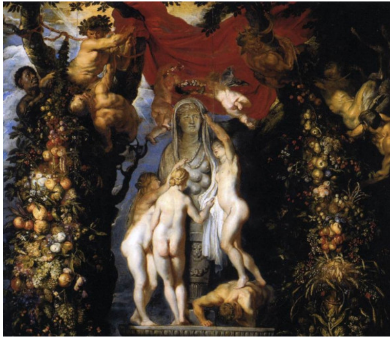
Figure 4. Nature adorning the three graces (upper part). Table by Rubens and Bruegel the Elder. The statue in the centre represents the "Mother Earth", the mother figure of Isis traditionally depicted with many breasts on her chest. [Source: Peter Paul Rubens, Public domain, via Wikimedia Commons]

It was not until the Renaissance that nature made a comeback in the European intellectual landscape, following the rediscovery of ancient texts, but without any real theorization of its meaning: nature is then seen either as the whole of creation (including Man or not), the set of physical forces that regulate the world ("natural laws"), or even a kind of abstract power of reality, sometimes allegorized in "Nature" with capital letters, a sort of earthly emissary of the divine will, even a feminine and benevolent counterpart of the Almighty Father (nature was already allegorized at the end of antiquity under the maternal figure of Isis, who was later secularized in the idea of "Mother Nature" [5]) (Figure 4). The fact that Plato, the meta-physician par excellence, does not seem to have been interested in this concept , which was too material, whereas philosophers gradually erected him during the classical age as the chief arbiter of what is or is not a philosophical concept, probably contributed later on to its scorn by most of the European academic tradition, and this until today.