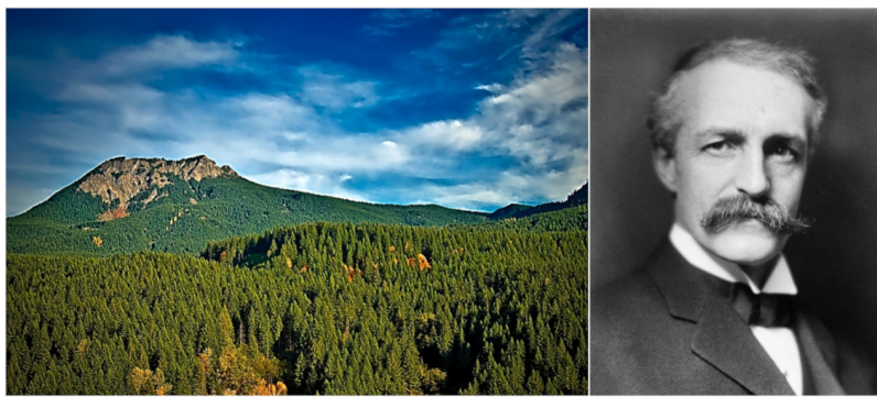
Figure 5. Pinchot National Forest (Washington, USA) and portrait of Gifford Pinchot

Historically, human societies first protected natural " resources " (wood, game, "useful" animals and plants...) [9], "nature" itself being too abstract and too massive to be the object of direct human action. As early as the Mesolithic period, sedentary human groups began to save part of their resources to ensure their reproduction and permanence. This management was later entrusted to specialized corporations, such as in France the Administration of Water and Forests, created by Philippe le Bel in 1291, before being modernized by Colbert in 1669. In the US, it was Gifford Pinchot (trained at the Ecole de Nancy) who was the great protector of natural resources at the end of the 19th century, faced with the increasingly ferocious appetite of loggers (Figure 5).