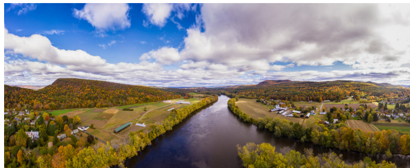
Figure 11. Mount Toby Farm (Sunderland, MA, USA) works closely with the USDA (Department of Agriculture) and NRCS (Natural Resources and Conservation) to preserve the environment. This kind of model is still exceptional in America, unlike Europe.

The scale changed radically at the end of the twentieth century: it was no longer a question of protecting objects, but rather phenomena, on an ever-increasing scale, and finally on a global scale. The very idea of reserve finds its limits here, since these flows and phenomena overflow them largely, and it is therefore the whole organization of human societies that needs to be reviewed , because this protection can no longer be satisfied with a handful of desert or mountainous areas that are sanctuarized because they were unproductive anyway. The climate, the circulation of water and the balance of biodiversity depend less on Yellowstone Park or the Monument Valley than on the use of the fertile soils of the great river plains where all human activities are concentrated, and the artificial separation of nature and humans seems quite illusory [14] (Figure 11).