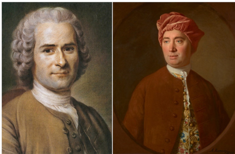
Figure 2. Portraits: left, Jean-Jacques Rousseau (1712-1778), right, David Hume (1711-1776).

Even today, specialized encyclopaedias still seem to carefully avoid the concept of "nature": this is for example the notable case of the Oxford Dictionary of Science (2005), but also of the Encyclopedia of environmental ethics and philosophy (2008). The Encyclopaedic Dictionary of Ecology and Environmental Sciences gives it three lines that do not say much, and the Dictionary of Ecological Thought (2015), for its part, takes the precaution of specifying its articles ("nature in philosophy", "ordinary nature"), thus carefully circumventing the idea of nature itself - although this does not prevent its use in many articles. The same observation can be made on philosophers : nature does not stand among the "major notions of philosophy" in the main university textbooks, has never been on the syllabus of any French examination or competition, and one of the few textbooks to deal with it, André Lalande's Vocabulaire technique et critique de la philosophie (regularly updated since 1902) imitates d'Alembert by recommending rigorous thinkers to avoid the use of this word, which can mean everything and its opposite . Moreover, the term is openly circumvented by many scientists, who prefer better defined and above all measurable hyponyms - because in the modern age there is no science without quantification - such as "biosphere", "biodiversity", "biocenosis", "ecosystems" and other "physicalities" among anthropologists.