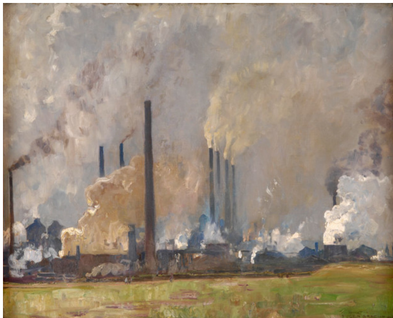
Figure 7. The first pollution of great importance emerged with the industrial revolution. [Source: Eugen Bracht, Public domain, via Wikimedia Commons]

The protection of this nice and aesthetic natural environment is known under the particular name of environmentalism , a term that contains its anthropocentric dimension very well, and which should be distinguished from ecologism. In fact, it is above all a question of protecting humans, first against wild nature and then rapidly against human nuisances themselves: it is in this respect that various regulations of these nuisances appeared, whether it be the creation of sewers and latrines in ancient times, then more important measures with the Industrial Revolution (Figure 7): in France, for example, the Imperial Decree of 15 October 1810 relating to " Manufactures and Workshops which spread an unhealthy or inconvenient odour ", and in England the creation in 1815 of the Commons Open Spaces & Footpaths preservation society . Most of the first environmental laws fall within this framework, and protect a very specific "nature", which is domesticated nature seen as Mankind's support - and is not necessarily less legitimate for all that.