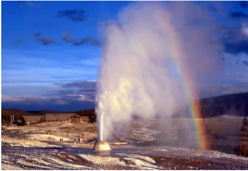
Figure 9. Rainbow over a geyser in Yellowstone National Park, Wyoming, USA.

making it possible to understand that some of them had indeed irretrievably disappeared, whereas until then one could always imagine residual populations (even for fossil species, Figure 8). One thus becomes aware that God does not seem to "re-create" his creations if Men destroy them, and the relationship with nature then changes abruptly with the first romantic generation: nature then passes from the mysterious mother of infinite abundance to the fragile battlefield of the human history .