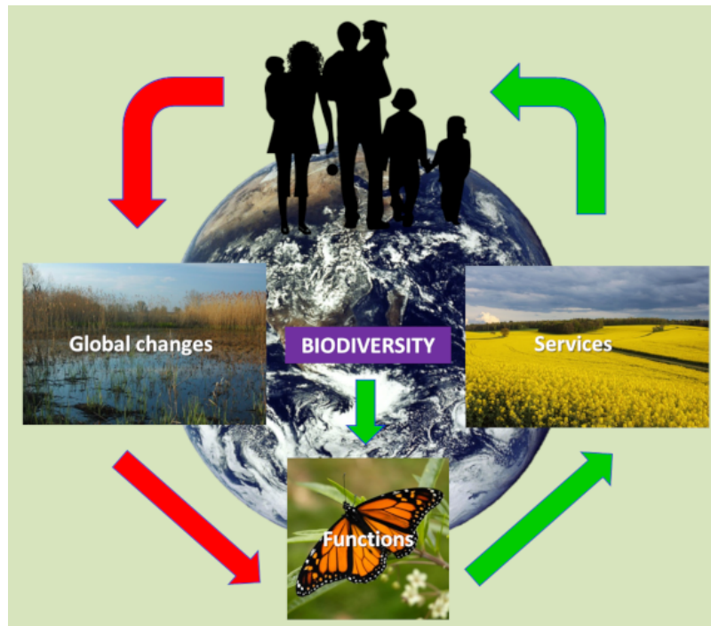
Figure 2. Relationships between biodiversity, ecological functions, services and society. Excessive pressure can lead to several types of damage (global change)

For a long time compartmentalized, biodiversity research is currently tending to integrate functions and services, particularly following the work of the Millennium Ecosystem Assessment prepared at the initiative of the UN for the Convention on Biological Diversity (CBD). This international treaty, adopted at the Earth Summit in Rio de Janeiro in 1992, aims to (i) conserve biodiversity, (ii) ensure the sustainable use of its components and (iii) share fairly and equitably the benefits arising from the use of genetic resources. The CBD is a key document for sustainable development in which biodiversity is considered a key issue. Since 2012, the Intergovernmental Platform on Biodiversity and Ecosystem Services (IPBES), launched by the United Nations Environment Programme (UNEP), is bringing together a panel of experts launched as a group something like the Intergovernmental Panel on Climate Change (IPCC).