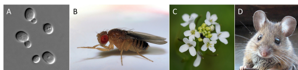
Figure 2. Examples of model organisms used in genetics. A, Baker's yeast. B, Drosophila. C, Thale cress. D, Mouse

A first type of regulation depends on the number of lesions in the cell . This phenomenon was first highlighted in the colibacillus ( Escherichia coli ), a bacterium that is one of the preferred subjects of study for geneticists. As early as 1974, it was assumed that there was a response, called SOS [2], which regulates the intervention of several repair systems according to the number of injuries. When there is a small number of lesions, this response increases the effectiveness of faithful repair mechanisms . But beyond a certain threshold of damage, these mechanisms are overwhelmed. The SOS response then induces the synthesis of a replicase able to cross specific lesions (see below), but with a certain error rate. This is called SOS mutagenesis . At the end of the 1990s, it was shown to facilitate the adaptation of the bacterial population to a hostile environment, at the cost of significant losses due to harmful mutations. It is a kind of last chance, hence the name SOS.