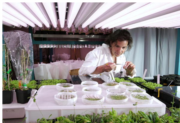
Figure 3. Experimentation on Arabidopsis thaliana seedlings.

A third level of adaptation falls between the two previous levels. Like the first level, it is individual and plays only on the regulation of gene expression, without intervention on their structure. But this third level involves a transient hereditary transmission of these regulations. This allows descendants, over a few generations, to benefit from the adaptive response of their parents. This is referred to as epigenetic memory or transgenerational effect (see Epigenetics, the genome and its environment ). This type of phenomenon has been known for a long time, but it has remained relatively exceptional. The first known cases mainly concerned paramecia, unicellular eukaryotes {ind-text} Unicellular or multicellular organisms whose cells have a nucleus and organelles (endoplasmic reticulum, Golgi apparatus, various plasters, mitochondria, etc.) delimited by membranes. Eukaryotes are, along with bacteria and archaea, one of the three groups of the living organism. {end-tooltip} . Since 2000, examples have multiplied and cover a wide range of characters. They have often been observed in response to environmental stresses, but also in the case of maternal behaviours in rats [2].