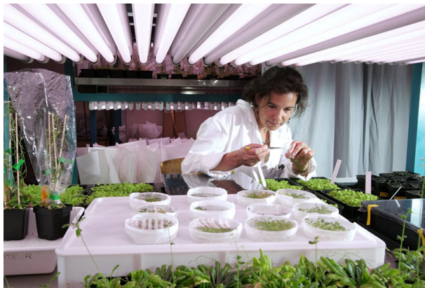
Figure 3. Experimentation on Arabidopsis thaliana seedlings.

A third level of adaptation falls between the two previous levels. Like the first level, it is individual and plays only on the regulation of gene expression, without intervention on their structure. But this third level involves a transient hereditary transmission of these regulations. This allows descendants, over a few generations, to benefit from the adaptive response of their parents. This is referred to as epigenetic memory or transgenerational effect (see Epigenetics, the genome and its environment ). This type of phenomenon has been known for a long time, but it has remained relatively exceptional. The first known cases mainly concerned paramecia, unicellular eukaryotes{ind-text}Unicellular or multicellular organisms whose cells have a nucleus and organelles (endoplasmic reticulum, Golgi apparatus, various plasters, mitochondria, etc.) delimited by membranes. Eukaryotes are, along with bacteria and archaea, one of the three groups of the living organism.{end-tooltip} . Since 2000, examples have multiplied and cover a wide range of characters. They have often been observed in response to environmental stresses, but also in the case of maternal behaviours in rats [2].