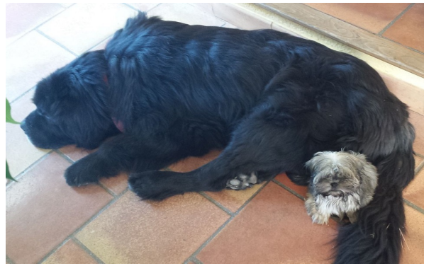
Figure 2. The variety of dog breeds illustrates the extent of unintended hereditary variability. By using it, man has been able, from the wolf, to obtain lines as different as a Newfoundland and a Shih Tzu.

The two pillars of the theory, fortuitous hereditary variability and natural selection, are often very poorly understood.