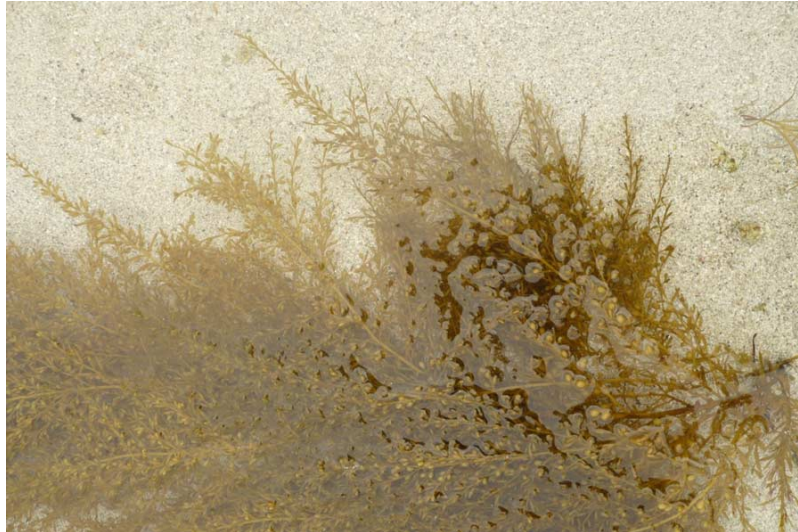
Figure 20. Partial view of Sargassum muticum, a large brown alien seaweed from the Pacific and living at the limit of the medium- and infralittoral in calm mode.

finally, many crustaceans, such as crabs, are scavengers or detritus feeders (eaters of corpses or various organic detritus).