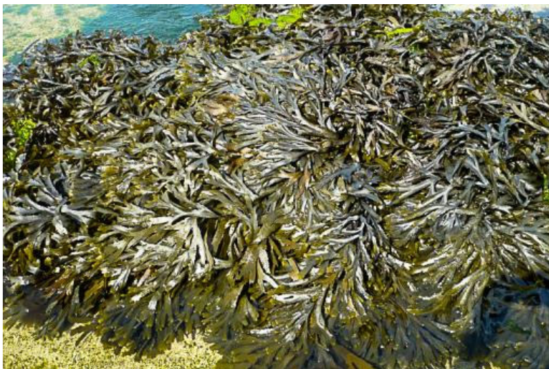
Figure 13. Fucus serratus , toothed thallus, of the lower midlittoral.

Finally, most of the lower midlittoral (about 30 to 20% of the time emerging) is colonized by Fucus serratus , still without floats (Figure 13).