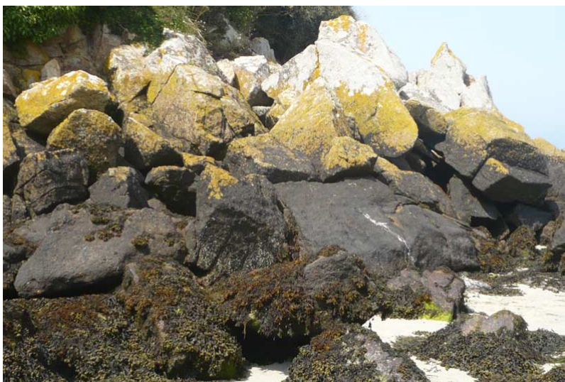
Figure 8. Lichen and algae belts from the adlittoral to the upper midlittoral.

Lichens are originally terrestrial organisms. This is why, unlike algae and marine animals, their specific diversity decreases as they descend towards the sea. Many species of lichens can be found on coastal rocks, some of which also live inland ( Xanthoria parietina ) and others are typical of the marine coastline ( Verrucaria maura , Lichina spp.) [3].