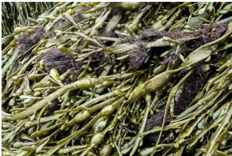
Figure 11. Ascophyllum nodosum , especially common in the calm midlittoral, and its parasitic red alga Vertebrata lanosa .

The upper midlittoral (about 70-80% of the time emerging) consists of two algae belts that can withstand desiccation very well and can lose up to 75% of their water without dying; these are Pelvetia canaliculata (Figure 10A) and Fucus spiralis (Figure 10B); these algae are absent in very rough environments (Figure 6).