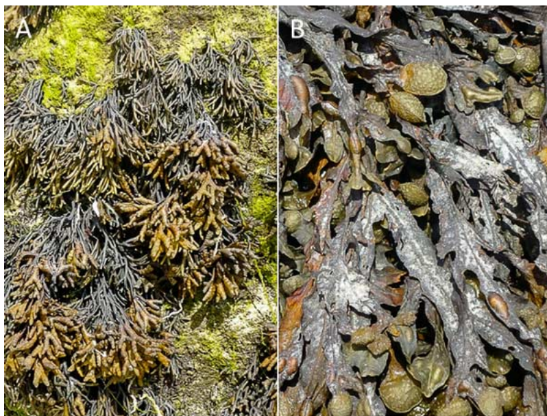
Figure 10. Pelvetia canaliculata (A) and Fucus spiralis (B), of the upper midlittoral not too beaten.

Brown algae or Phaeophyceae, Fucales and Laminariales, largely dominate rocky foreshores by their biomass [2]. They were once used to extract soda by burning it in ovens or to fatten fields, under the name of varech in Normandy and goémon in Brittany [5] i.e. wrack or kelp in English. They therefore form the characteristic belts of the mid- and sub-littoral levels. Their size, as well as their biomass, increases as they descend: 10 cm for Pelvetia , about 1 m for Ascophyllum and Sargassum and up to 5 m for Himantalia and Laminaria hyperborea . The floats of some algae allow them to stand vertically at high tide, towards the light, in the case of Ascophyllum and Fucus vesiculosus .