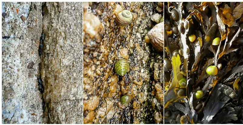
Figure 18. Three examples of rocky foreshore Littorinidae, from left to right: A, Melaraphe neritoides , 5 mm, supralittoral cracks; B, Littorina nigrolineata , 1 to 1.5 cm, on rocks of the upper midlittoral; C, Littorina littoralis , 1 cm, medium to lower midlittoral Fucus grazer.

In the crustacean group, barnacles are attached to the rock and protected by solid limestone plates; they also form more or less regular belts: Elminius modestus and Chthamalus stellatus (Figure 6) at the top, Balanus balanoides in the middle and Balanus perforatus and B. crenatus at the lowest levels.