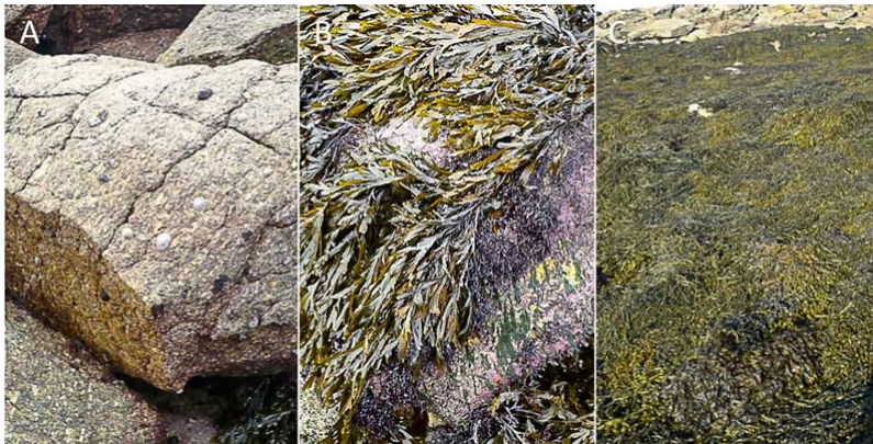
Figure 4. Effects of sea agitation on medium-coastal organisms: A, very beaten mode, without algae and with fixed animals; B, medium beaten mode, with Fucus serratus and various red algae on the shaded edge; C, calm mode, with Ascophyllum nodosum .

fixed or with too soft a body, cannot survive in beaten environments, while others need highly oxygenated beaten water to survive. It should be noted that the same coastal site can be very beaten in the upper mid-coast (by the high tide swell which arrives without obstacles) and relatively calm in the lower mid-coast or the infralittoral (where the waves are slowed down by various obstacles at low tide).