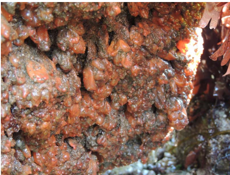
Figure 5. Overhang of shaded rock with Dendrodoa grossularia or sea gooseberry, social ascidia.

Algae and lichens need light for photosynthesis{ind-text}Bioenergetic process that allows plants, algae and some bacteria to synthesize organic matter from the CO 2 in the atmosphere using sunlight. Solar energy is used to oxidize water and reduce carbon dioxide in order to synthesize organic substances (carbohydrates). The oxidation of water leads to the formation of O 2 oxygen found in the atmosphere. Photosynthesis is at the base of autotrophy, it is the result of the integrated functioning of the chloroplast within the cell and the organism.{end-tooltip}, but too much light is often harmful to organisms used to be protected