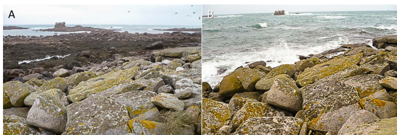
Figure 2. A rocky coast from Brittany at low tide (A) and high tide, 6 hours later (B).

This factor is essential on the so-called tidal coasts of the Atlantic and the English Channel (and very secondary in the Mediterranean) (see The tides ). Twice in about 24 hours, the intertidal zone is alternately submerged at high tide and emerged at low tide (Figure 2). This causes strong constraints on flora and fauna, mainly of marine origin. Moreover, according to the lunar and seasonal cycles, the amplitude of tidal sway varies greatly: important towards the full moon or the new moon and towards the equinoxes, it is quite low in the first and last quarters of the moon and towards the solstices [1] (see Light cycles and living organisms ).