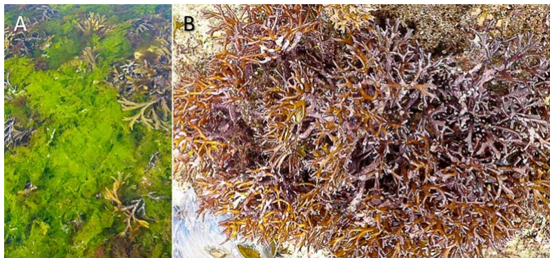
Figure 16. A, Sea lettuce, Ulva spp., here fixed on low level rocks; B, Chondrus crispus , red algae of the lower midlittoral

Other algae do not form real belts, continuous or regular [2].