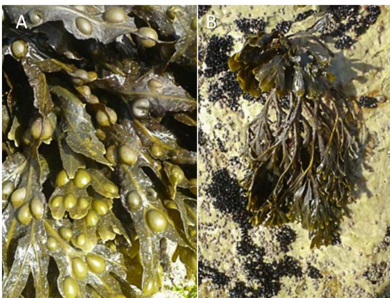
Figure 12. A, Fucus vesiculosus of the middle medolittoral lightly beaten to calm, with floats; B, Fucus vesiculosus var. linearis of the midlittoral well beaten, without floats.

The upper midlittoral (about 70-80% of the time emerging) consists of two algae belts that can withstand desiccation very well and can lose up to 75% of their water without dying; these are Pelvetia canaliculata (Figure 10A) and Fucus spiralis (Figure 10B); these algae are absent in very rough environments (Figure 6).