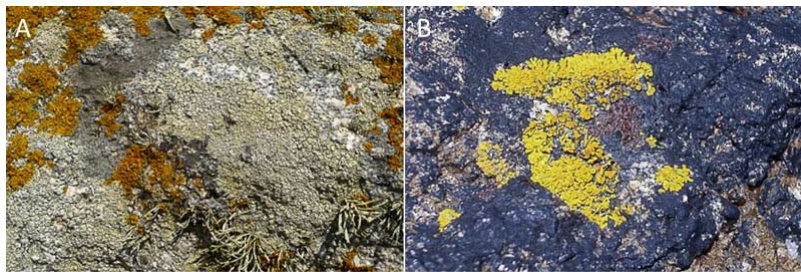
Figure 9. A, Lichens exposed to adlittoral spray: Ramalina spp. in grey-green tuft, Xanthoria spp. in orange patches, Ocrolechia parella in grey crust; B, Lichens of the supralittoral, sometimes covered by the sea: Verrucaria maura in black and Caloplaca spp. in yellow.

The supra-coastal layer, covered at very high tides, is colonized by the crusts of Caloplaca marina and C. maritima scattered in an almost continuous black belt of Hydropunctaria (= Verrucaria ) maura (Figure 9B). This last fine-crusted lichen is often mistaken for a remnant of oil spills! Among the rare lichens in the mid-coastal zone are Lichina pygmaea , which live in very beaten environments (Figure 6).