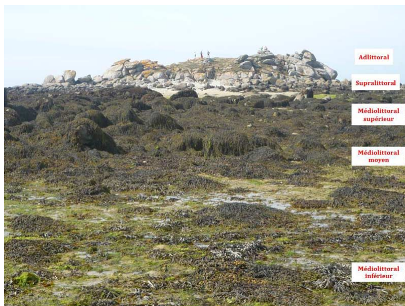
Figure 3. A rocky foreshore at low tide, with its different levels; the infralittoral is not present in this photo.

The tidal range , or maximum difference in level between the lowest and highest seas, is typical of a given place and depends on the conformation of the coasts: 14 m in the bay of Mont Saint Michel, 8.50 m in Roscoff, about 6 m in Le Havre and Nantes, just over 4 m in Biarritz. The larger the tidal range, the wider and more diversified tidal swing areas and the wider the belts, thus understanding the interest of the French coasts of the Western Channel, from Cherbourg to Brest.