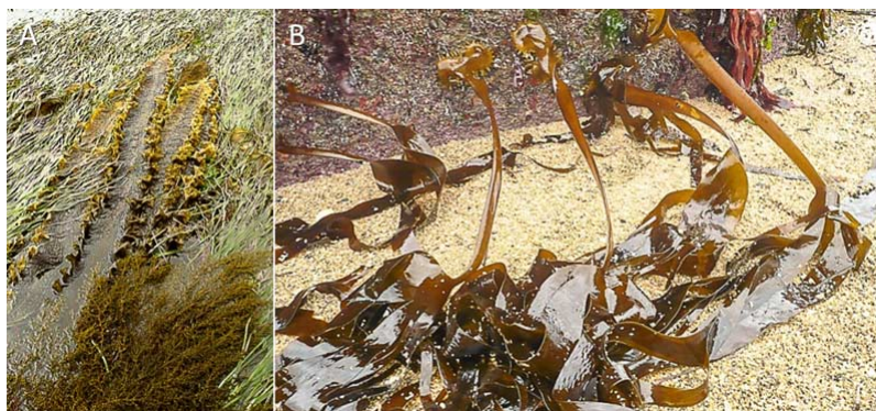
Figure 14. A, Saccharina latissima with long undulating thallus, of calm mode; B, Saccorhiza polyschides , attached by bulbous complex holdfast and with flattened stipe, and Palmaria palmata , large red algae at the top right, at the limit of the lower midlittoral rather beaten.

The base of the lower midlittoral and the upper infralittoral (less than 10% of the time emerging) host the large thalli of Saccharina latissima (= Laminaria saccharina ) (Figure 14A) in a calm environment, from Saccorhiza polyschides (Figure 14B) with flattened and soft stipe, edible Himanthalia elongata (Figure 15) or sea bean, with very long narrow and dichotomous branching pattern at each growth level. More generally, characterizes the division of something into two clearly opposed elements axes, and Laminaria digitata (Figure 15) with a smooth and flexible cylindrical stipe, in more or less beaten environments.