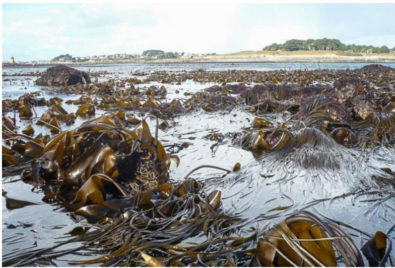
Figure 15. Himanthalia elongata , with narrow dichotomous thallus, and Laminaria digitata , with deeply torn blades and flexible cylindrical stipe, two species typical of the upper infralittoral.

The last belt, in the infralittoral never or very rarely emerged, consists of Laminaria hyperborea , with a stiff cylindrical stipe. The biomass of these algae is sometimes very high and is said to form "underwater forests". Between Roscoff, Ouessant and Le Conquet, this species forms, with other kelps, the largest and richest algae sector in Europe (the Seaweed Coast), where a semi-industrial exploitation takes place for alginate extraction, among others.