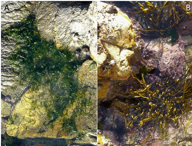
Figure 17. A, Upper midlittoral bowl housing Ulva (= Enteromorpha ) compressed, green algae, and the gastropod Monodonta lineata ; B, Middle midlittoral bowl with a brown alga, Bifurcaria bifurcata , and various calcified, branched or encrusted Corallinaceae (red algae), pale pink in colour.

The rocky basins, always filled with water, disturb the belt zoning of the foreshore; they offer a favourable biotope for various species that do not tolerate dehydration due to the exposure [11],[2]. Their level on the foreshore, their size, their depth and their illumination will condition their stands. The high level basins, which are desalinated, heated or lose their oxygen quickly, are poor in species, with mostly green algae (Figure 17A). Those below mid-tide level support a variety of animals: sea anemones, shrimps, gastropods, small fish, as well as various algae that normally live below and outside the basins. Figure 17B shows the brown alga Bifurcaria bifurcata (15 cm long) and various crustose calcified red algae of the Corallinaceae family; the latter do not leave the bottom of the basin and thus avoid dehydration.