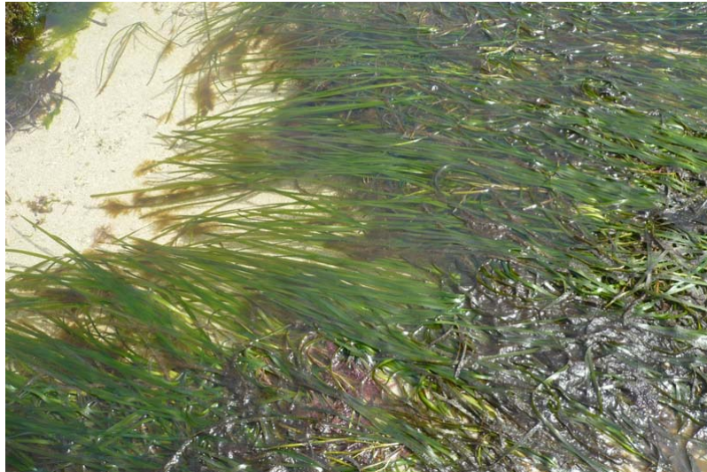
Figure 1. Meadows of Zostera marina , eelgrass, a marine flowering plant, on low sandy levels. Due to its habitat and morphology (especially the presence of long ribbon-like leaves), many people think that eelgrass is an algae. In fact, it has roots anchored in the sand. Eelgrass beds have a high biological diversity.

slightly mobile animals also have such a vertical zoning, while more mobile species (fish, shrimps, various molluscs) follow the movements of the sea or take refuge in basins or sheltered blocks to survive.