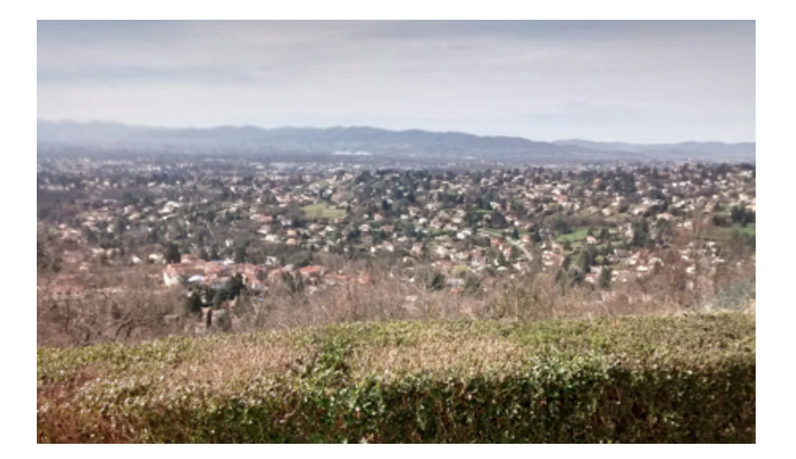
Figure 4. Peri-urbanization, a multiple environmental impact.

The urban phenomena of the second half of the twentieth century, such as urban sprawl and peri-urbanization, must also be the subject of a historical study that takes into account their consequences on the environment. Hundreds of thousands of square kilometres have been concreteized, "bulldozerized" and waterproofed to satisfy the lifestyle of the residents of residential neighbourhoods. The lawn of individual pavilions treated with phytosanitary products has replaced woods, grasslands and small wetlands sometimes close to urban centres [6]. The spread of large urban areas is no longer specific to Western countries: Delhi occupied 13 times more space in 1990 than in 1900; Beijing only doubled in the 1990s.