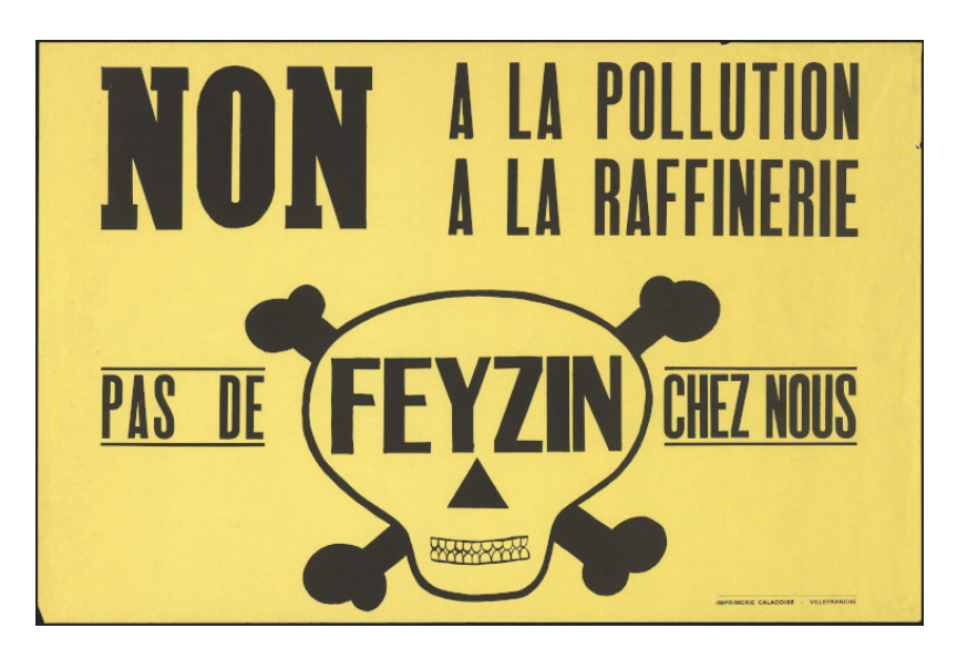
Figure 5. Activist poster produced as part of the mobilization against a second refinery, spring 1971.

The environmental issue, previously confined to exceptional natural spaces and industrial nuisances, has emerged on the public scene through famous books that denounce pollution by synthetic pesticides (Rachel Carson, Silent Spring , 1962, translated into French the following year with a preface by Roger Heim), or the impact of population growth and the consumption of natural resources and the production of capital goods. These include cars, but also the risks associated with oil transport, such as oil spills (Torrey Canyon in 1967, Amoco Cadiz in 1978).