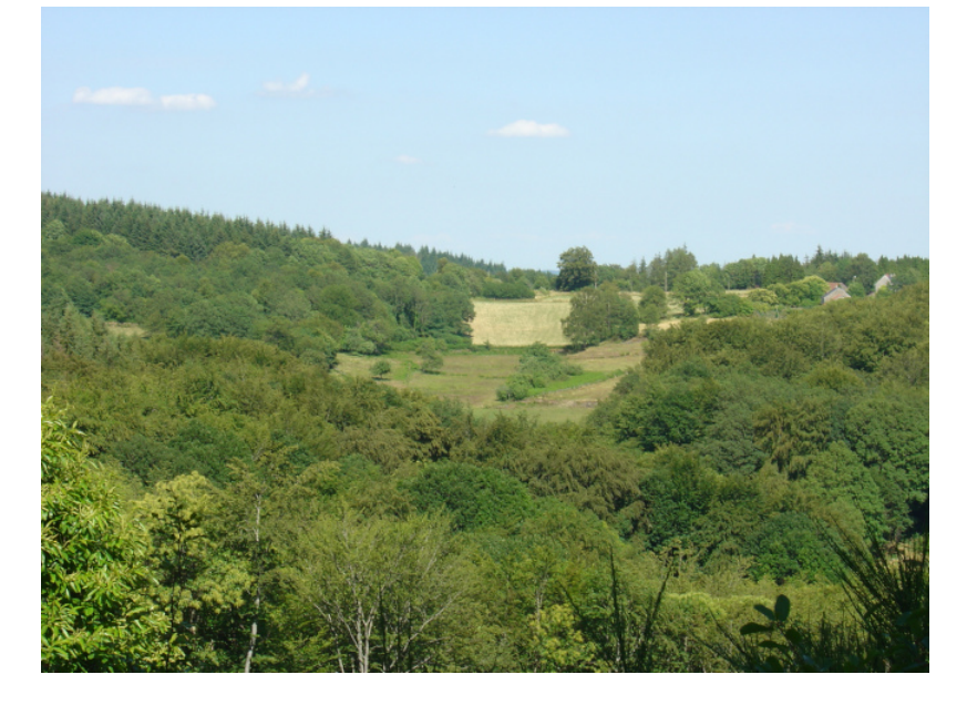
Figure 2. Landscape of forest recovery in Limousin, 2004.

The major fields of environmental history first intersected the main types of environments, traditionally studied by geography. The first environment to have been the subject of a specific research group was that of forests. The French forest history group created in the early 1980s immediately brought together historians, geographers, silviculturists and managers. The approaches have been very different, from the history of wood use - used by metallurgy until the 19th century - to that of media representations or the management of catastrophic episodes, of which the 1999 storm is one of the most recent manifestations on French territory.