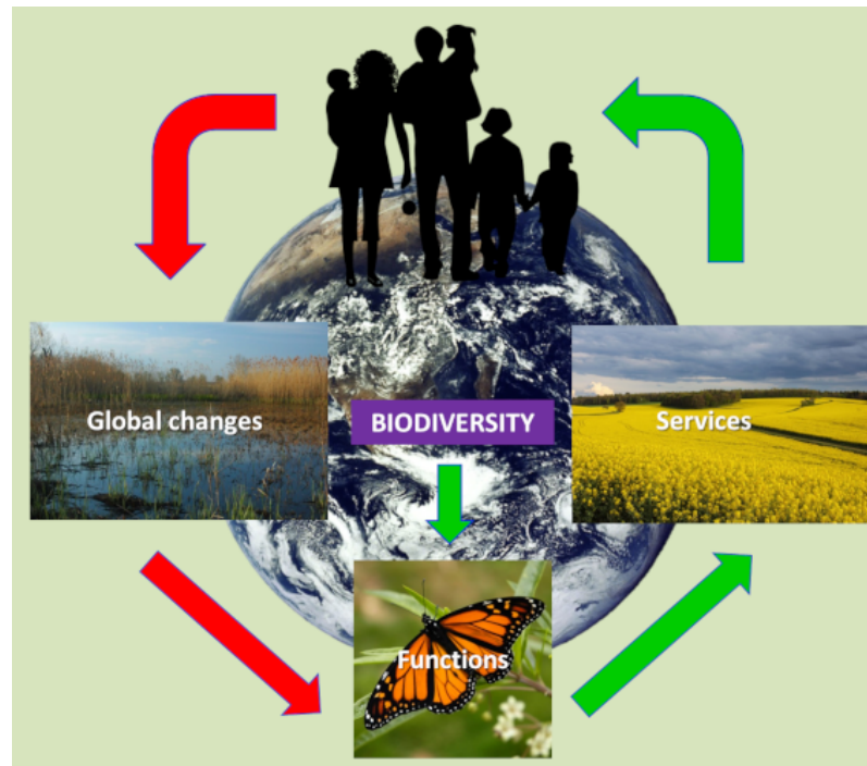
Figure 2. Relationships between biodiversity, ecological functions, services and society. Excessive pressure can lead to several types of damage (global change)

For a long time compartmentalized, biodiversity research is currently tending to integrate functions and services, particularly following the work of the Millennium Ecosystem Assessment prepared at the initiative of the UN for the Convention on Biological Diversity (CBD). This international treaty, adopted at the Earth Summit in Rio de Janeiro in 1992, aims to (i) conserve biodiversity, (ii) ensure the sustainable use of its components and (iii) share fairly and equitably the benefits arising from the use of genetic resources. The CBD is a key document for sustainable development in which biodiversity is considered a key issue. Since 2012, the Intergovernmental Platform on Biodiversity and Ecosystem Services (IPBES), launched by the United Nations Environment Programme (UNEP), is bringing together a panel of experts launched as a group something like the Intergovernmental Panel on Climate Change (IPCC).