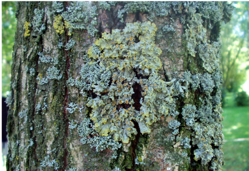
Figure 1. Examples of epiphytic lichens used for overall air quality biomonitoring. Noteworthy in this photo are Xanthoria parietina (yellow lichen), Physcia adscendens and Physcia tenella (blue lichens).

The first "modern" observations focused on the evolution of the lichen communities. In the 1970s and 1980s, the main air pollutants in Western Europe were sulphur dioxide and suspended dust (SO 2 and PS), mainly of industrial origin. At that time, different authors such as Hawksworth and Rose [4] in England or Van Haluwyn and Lerond [5] in France studied the impact of these pollutants on epiphytic lichen communities (developing on tree trunks, Figure 1). These authors observed a clear impact of air pollution on the specific composition of lichenic communities (decrease in specific richness but also modification of the composition of lichen populations observed on trunks with an increase in pollution), as did Nylander previously mentioned. They have developed different methods for assessing the effects of air pollutants directly in the field, through the observation of lichen species. These methods were based in particular on the observation of the presence and abundance of species more or less sensitive to pollutants. The air pollution situation has gradually evolved and become more complex (decrease in SO 2 , increase in concentrations of nitrogen, ozone, organic compounds, etc.).