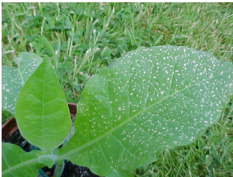
Figure 3. Ozone leaf necroses on tobacco leaves.

Some pollutants will cause characteristic, visible symptoms on plants (see article What is the impact of air pollutants on vegetation? ). The most significant example is ozone, which causes leaf necrosis . We have several models, the most "famous" being the Bel W3 tobacco whose use in biomonitoring is standardized (AFNOR X95-900 standard) [7]. Ozone causes white, ivory leaf necrosis in this species (Figure 3). During exposure, the formation of necrosis in the "Bel W3" variety plants is compared with the more resistant "Bel B" variety plants to assess ozone damage and confirm that it is not damage caused by phytopathogenic organisms.