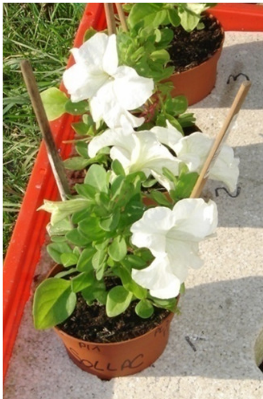
Figure 4. Petunia plants used for the biomonitoring of volatile organic compounds.

Foliar damage caused by ozone occurs at a concentration of 80\mu\text{g}/\text{m}^3 or more. The higher the ozone concentration, the greater the necrotic leaf area. The survey of this necrotic surface is carried out on a weekly basis, on the different sites where the plants are placed, the leaves are compared with reference photos.