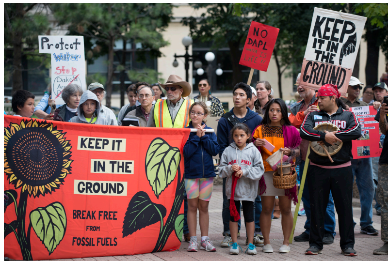
Figure 3. Demonstration calling for a halt to the construction of the pipeline to pass upstream of the Sioux Nation of Standing Rock (Dakota, USA). With the threat of their water supply, the tribe claims that the pipeline will destroy burial sites and sacred sites.

In addition to planning practices, policy towards minority and/or stigmatised population groups can create or reinforce environmental inequalities: we have mentioned racial segregation in the United States, but the status of indigenous peoples and major developments on their ancestral territory produce environmental inequalities in many countries (United States, Canada [12], Australia...), combining poor access to the decision-making process, negative impacts on indigenous societies and their practices, and low or no redistribution of the income generated by equipment (Figure 3).