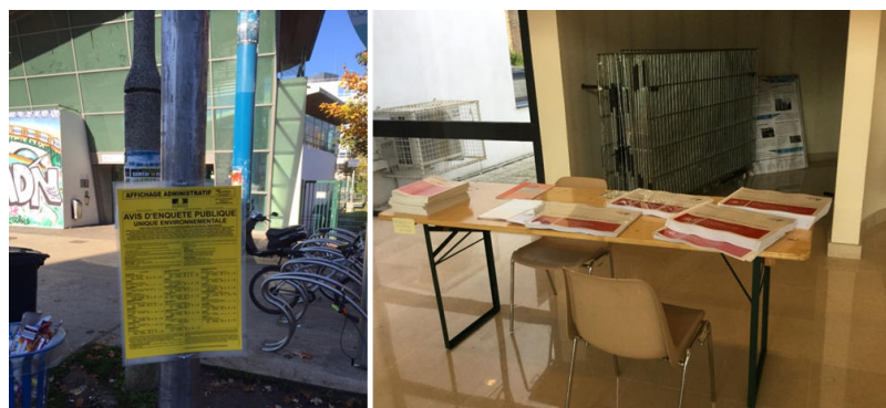
Figure 4. Photographs illustrating the official publication of a public inquiry and the place where documents are consulted

In addition to planning practices, policy towards minority and/or stigmatised population groups can create or reinforce environmental inequalities: we have mentioned racial segregation in the United States, but the status of indigenous peoples and major developments on their ancestral territory produce environmental inequalities in many countries (United States, Canada [12], Australia...), combining poor access to the decision-making process, negative impacts on indigenous societies and their practices, and low or no redistribution of the income generated by equipment (Figure 3).