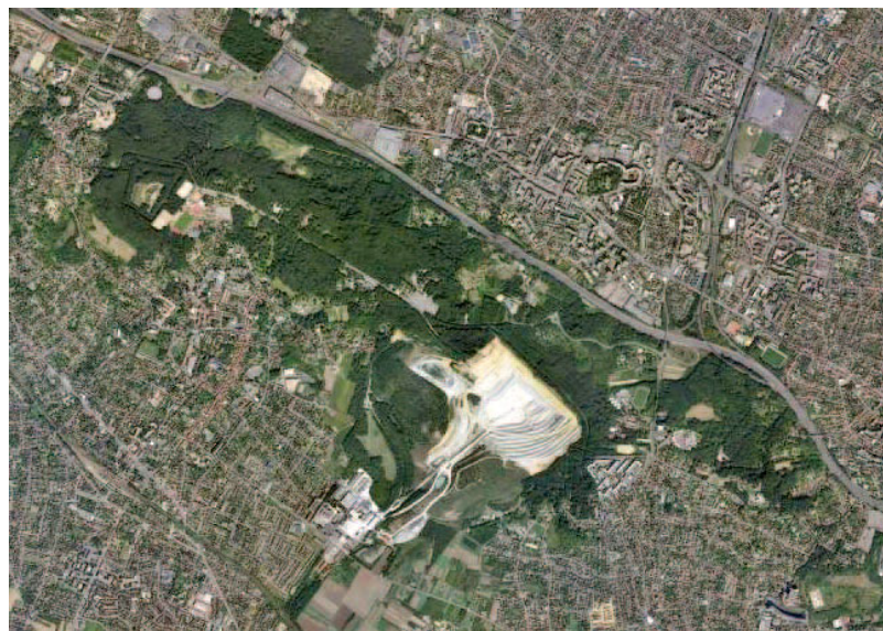
Figure 6. Aerial view of the Cormeilles-en-Parisis (Val-d'Oise) gypsum quarry located northwest of Paris. Gypsum is the raw material for making plaster.

These possible configurations cross most of the time and can be read at several scales. Thus, the unequal contribution to environmental damage can be seen at the global level through the effect of the globalization of flows. In 2006, a boat, the Probo Koala, spilled highly toxic substances in Abidjan, killing seventeen people and killing tens of thousands. The private company, an independent trader in petroleum products, which chartered it, could not get rid of this waste in Europe and therefore headed for Côte d'Ivoire in violation of European law which prohibits the export of certain types of waste from the EU to African, Caribbean and Pacific countries .