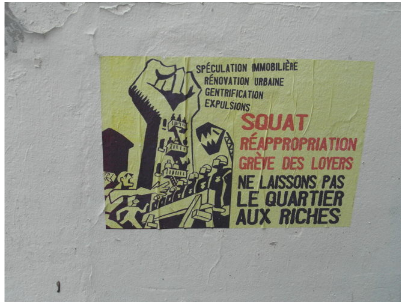
Figure 2. Poster denouncing the processes of planning and eviction of poor populations (Paris, 20th)

long history of "urban marginalization" and racialization of behaviour (bankers, urban planners, local communities, individuals' residential choices...) [6].