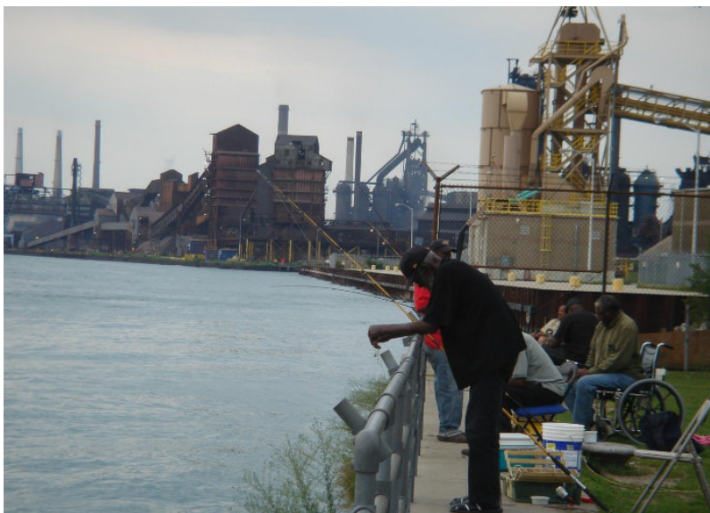
Figure 8. Along the Detroit River (Detroit)

The problem of environmental inequalities appeared in the United States in the late 1970s as "environmental justice", even if it was not born there, as Martinez-Allier points out ( ibid. ). Scientists, associations and concerned inhabitants initially denounce the polluted environments in which Black African populations are confined (Figure 8) and seek to objectify them by scientifically demonstrating the correlation.