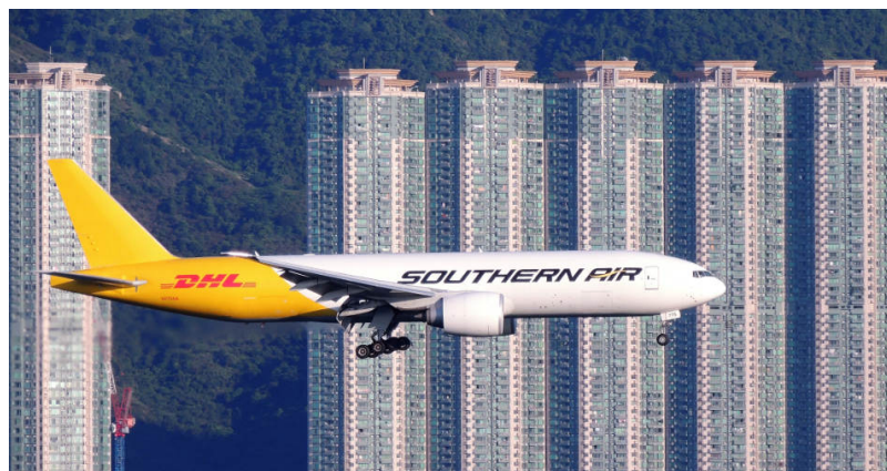
Figure 7. Landing in the middle of buildings in Hong Kong.

As we have seen, the absence of internalisation is a source of environmental inequalities between those who create damage to