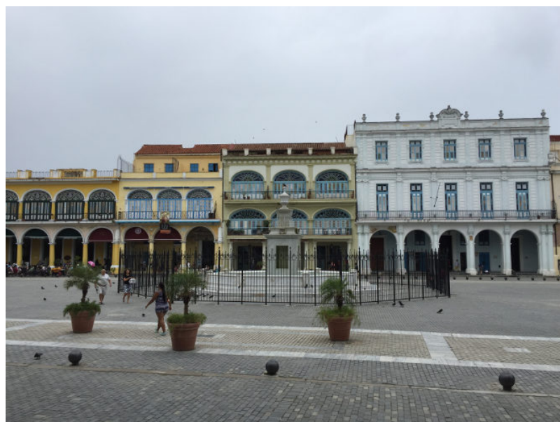
Figure 5. Fountain in Plaza Vieja (Havana) surrounded by grids

differentiated access to "environmental" resources . It is necessary here to distinguish several configurations: (1) different access to resources necessary to meet basic needs (clean water, unpolluted soil, breathable air, etc.) and to fulfil vital functions (healthy food, heating, housing, etc.) [16] and (2) different distribution and accessibility of environmental amenities and ecosystem services among individuals and populations.