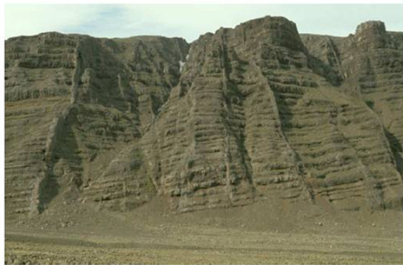
Figure 2. Dykes in Iceland: Once the magma has cooled, volcanic dykes correspond to large flat structures whose geometry reflects the orientation of the principal local directions of stress during the placement of the magma.

Because a hydraulic fracture propagates perpendicular to the minimum principal stress in the massif, its large-scale geometry is controlled by that of variations in minimum principal stress in the massif. For example, Figure 2 shows that volcanic dykes, once the magma has cooled, correspond to large flat structures that provide information on the state of local stress.