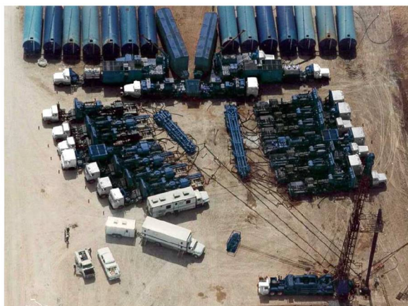
Figure 3. A hydraulic fracturing operation as carried out for non-conventional hydrocarbon exploitation. At the bottom we see the water tanks ready for an injection of about 500 m 3 . The drill head is visible in the lower right corner of the image. The trucks in front of the tanks prepare the fluid-sand mixture which is injected by the two rows of truck-mounted pumps. Each pump has a power of about 500 hp.

As early as the 1940s, it was realized that it was possible to maintain production at a satisfactory level by making hydraulic fractures . A pressurized liquid is injected into the reservoir rock, creating a tensile failure that is stable and perpendicular to the minimum principal stress in the solid mass [1] .