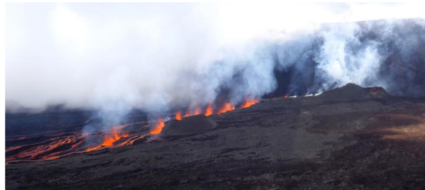
Figure 1. An example of natural hydraulic fracturing: the first phase of a basaltic eruption at Piton de la Fournaise (Reunion Island).

In summary, it can be said that a fluid at rest transmits pressure in the same way in all directions, which is not the case with a solid at rest. As a result, hydraulic fractures develop in the plane perpendicular to the direction of the minimum principal component of stress in the solid.