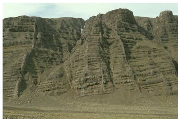
Figure 2. Dykes in Iceland: Once the magma has cooled, volcanic dykes correspond to large flat structures whose geometry reflects the orientation of the principal local directions of stress during the placement of the magma.

For example, the propagation rate of a volcanic dyke (Figure 1) during its formation is comparable to that of a walking man (about 100 m/min.).