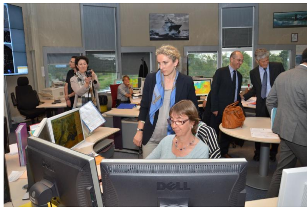
Figure 1. Visit of Mrs Delphine Batho, Minister of Ecology, Sustainable Development and Energy, to Météo France's National Forecast Centre (CNP) in Toulouse in 2013.

The forecaster's work is now essentially based on the interpretation of the available numerical simulations . It monitored progress in the means of constructing forecast data, such as improving the quality of the NWP models themselves and their post-processing (statistical adaptations). It has been made possible by the evolution of the possibilities to use the information provided and to visualize the planned fields. These have in fact shifted from graphic outputs on paper to computer representations [3]. In addition, the possibilities of formatting and disseminating these forecasts have increased (print media, audio-visual, telephone kiosks, Internet, mobile phones). Today, the company's performance requirements and the volume of information to be taken into account in very short periods of time make the work of the forecaster both difficult and exciting (Figure 1).