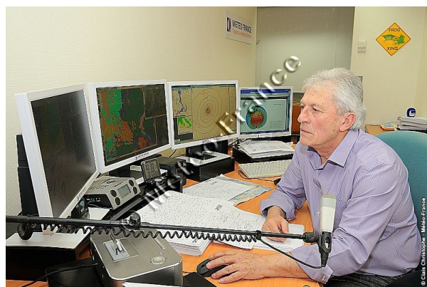
Figure 4. Joël Collado, forecaster of Météo France, an emblematic voice on Radio France from 1994 to 2015.

Some sectors of activity whose achievements depend on weather conditions use the services of meteorological entities to meet their needs. This function is called meteorological assistance or advice (Figure 4). Some structures choose to integrate this function within them. This is the case, for example, in France in a company such as EDF, where teams of forecasters are involved in the management of water resources for hydroelectric production. Other structures, which have more specific needs, outsource this function. Sports event organisers are highly publicised requesters. The missions are then carried out by specially trained forecasters. They provide tailor-made services sometimes by travelling to the place of activity to be as close as possible to the user. They can use dedicated observation means, such as mobile weather radars, which make it possible to significantly improve the anticipation of the occurrence of precipitation at the event site.