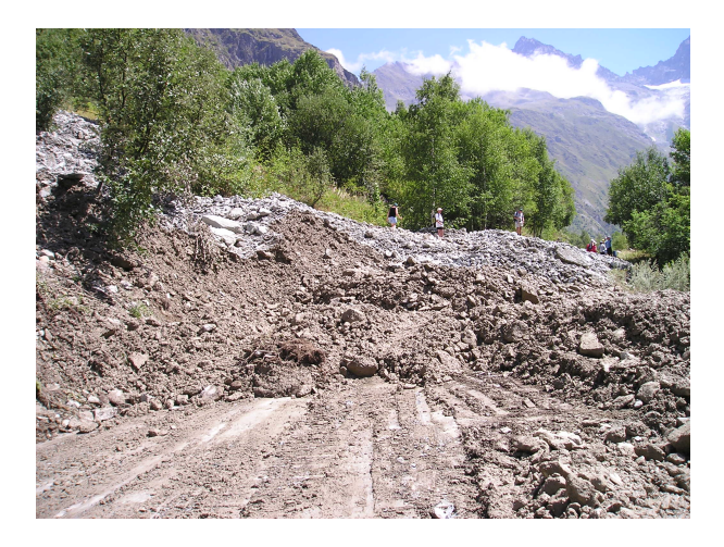
Figure 3. Example of torrential lava, occurring in July 2003, in the Valgaudemar valley (Hautes-Alpes).

Natural hazards may or may not be of gravity origin. Gravity natural hazards mainly include landslides (boulder falls, landslides, landslides), snow avalanches, and torrential floods (including mudflows). Risks of glacial origin are less frequent, although the risk of emptying subglacial water pockets must be considered (example of the Glacier de Tête Rousse, in the Mont-Blanc massif).