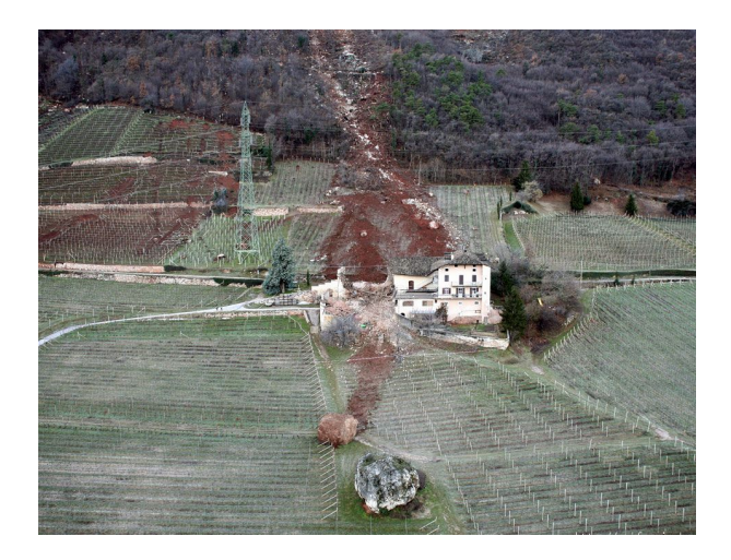
Figure 2. Vulnerability and rockfall, March 2014.

It should also be noted that the former presence of glaciers at the bottom of the valleys is the cause of the current moraine landscape, whose ultimate state of alteration is the formation of a granitic arena containing an often significant clay fraction. The presence of clay in the surface horizon of the soil is an element to be considered with great attention, due to the extreme sensitivity of the mechanical behaviour of clays to water content. In particular, a period of heavy rain, changing the hydraulic load in the soil, can cause major disorders such as landslides or mudslides.