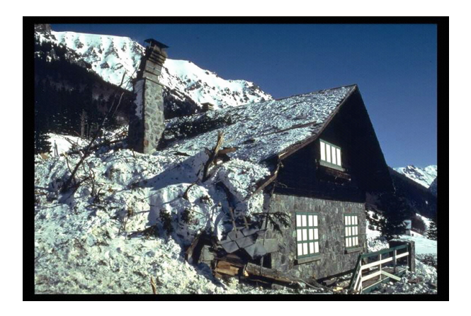
Figure 1. Montroc Avalanche, February 1999.

The vulnerability of a given site to a phenomenon expresses its degree of exposure to it, and the degree of damage expected in the event of the phenomenon occurring. We are talking about vulnerability for human equipment, facilities or infrastructure, but also generally for a social entity (a valley, a commune, a district, etc.). The notion of vulnerability therefore includes both physical and social values.