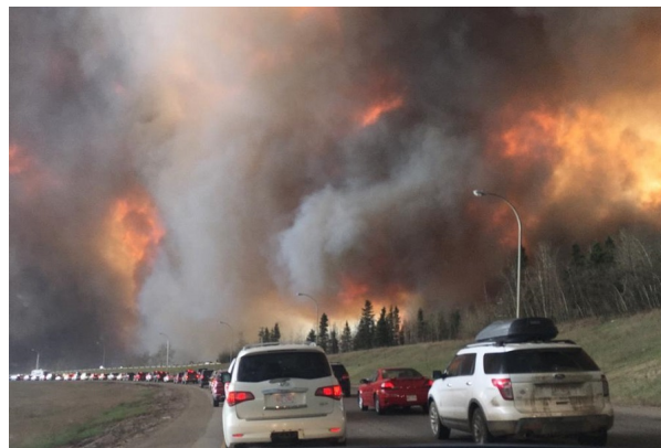
Figure 3. Evacuation of Fort McMurray (a city of 80,000 people in the state of Alberta, Canada) in May 2016.

Acting sustainably on the fire risk requires the restoration of a situation closer to the fire regime characteristic of a given ecosystem and for this purpose the reintroduction of fire as a tool for regulating the shrub biomass accumulated at ground level, in the form of prescribed fires. As in fire safety in buildings, biomass reduction is the only element of the fire triangle (Figure 1) on which action can be taken to reduce the fire risk in a sustainable way. With regard to the safety of property and people, as with other natural risks (flooding, submergence), it will be difficult not to review the conditions that have led to the urbanisation of certain areas, avoiding, for example, situations of urban sprawl (habitats scattered throughout the natural environment), which considerably complicate the conditions under which firemen and foresters operate. In regions where the level of risk is particularly high, innovative architectures should also be devised to reduce the level of vulnerability of dwellings, particularly in the treatment of roofs and openings.