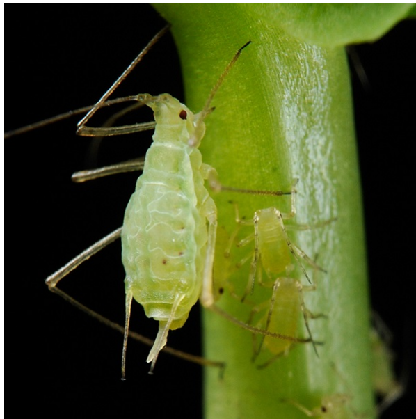
Figure 6. In the pea aphid Acyrtosiphon pisum the ability to survive on a host plant (clover or alfalfa) is conferred by different symbiotic bacteria. Adaptation to a given host plant is not the result of a sorting on the aphid's genes, but of a sort on the bacteria it hosts. Since bacteria have a higher reproduction rate than aphids, this adaptation mechanism via the associated partner could be a very effective way for organisms to respond quickly to sudden environmental change (e.g., crop rotation, etc.). In addition, the colour of individuals is conferred by symbiotic bacteria that produce the green pigment, providing better protection against predators (ladybirds) by camouflage (see ref. [7]).