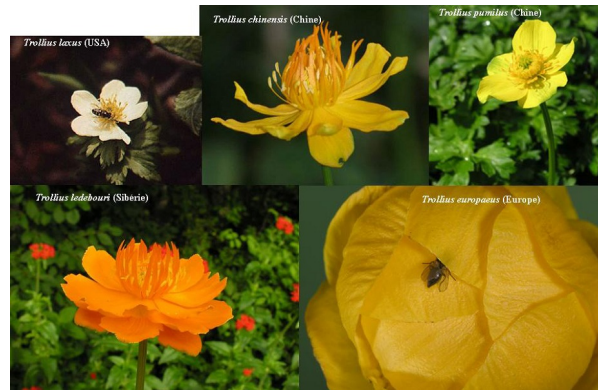
Figure 4. The diversity of corollas (shape, odour, colour) observed between species of the genus Trollius results from the interaction with different pollinators in this arctic-alpine plant of Himalayan origin.