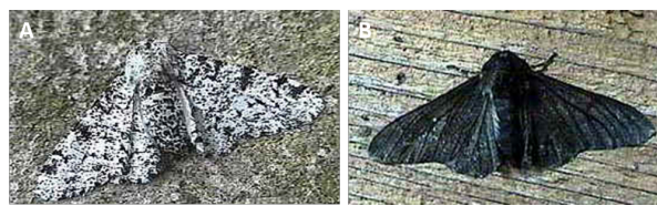
Figure 1. Industrial melanism in the peppered moth Biston betularia . This moth spends the day motionless on birch trunks, invisible to predatory birds (A, white typica morph). The black form, carbonaria (B), became the most abundant morph in polluted areas after the industrial revolution in England during the 19 th century.

Different individuals of the same species may encounter very different environmental conditions. For example, a plant growing in the plain does not face the same climatic constraints as a plant growing in the mountains. Similarly, an animal living in urban, agricultural or forest areas will not have access to the same resources and will not be exposed to the same pollutants... In addition to these abiotic factors, physical and chemical factors of an ecosystem influencing a given biocenosis. Opposable to biotic factors, they constitute part of the ecological factors of this ecosystem. Climatic factors (temperature, light, air...), chemical factors (air gases, mineral elements...) are abiotic factors... constraints, each individual is also constrained by its interactions with other living organisms biotic factors of an ecosystem are the flora and fauna and the relationships between them. The environment in which life can develop. constraints. As environmental constraints are locally variable, individuals with different traits will be selected locally. An adaptive trait is a morphological, physiological, or behavioural characteristic that provides a survival or reproductive benefit to individuals with that trait in a given environment. However, all spatially variable traits are not necessarily adaptive.