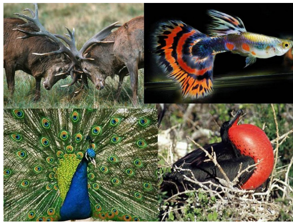
Figure 5. Extravagant sexual characteristics may be involved in competition between males for access to females, such as excessive antlers of deer, or in the choice of females, such as exuberant colours of guppies, peacocks or frigates.

The evolution of certain extravagant traits such as the excessive tail of peacocks or the bright colour of guppies may seem difficult to explain because they seem rather unfavourable in terms of survival (more visible to predators, bulky...); yet these sexual traits costly in terms of survival are selected in males because they allow better access to females, through direct competition between males, or because females choose males who have these traits to mate (Figure 5). It is sexual selection [6].