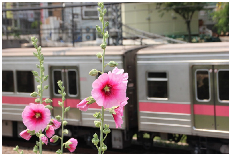
Figure 6. Hollow rose flowers in the city (metro in Korea).

Urban forests sequester some of the greenhouse gases, including CO 2 , and produce oxygen owing to photosynthesis. They purify a fraction of air pollution, particulate and gaseous (CO, NO x and NO 2 , and some non-biodegradable toxic substances for example). Finally, the tree enriches the soil with bacteria and fungi that degrade complex organic pollutants (some pesticides, PAHs, organochlorines, etc.). Increasing the number of urban trees, and greening cities leads to a reduction in pollution.