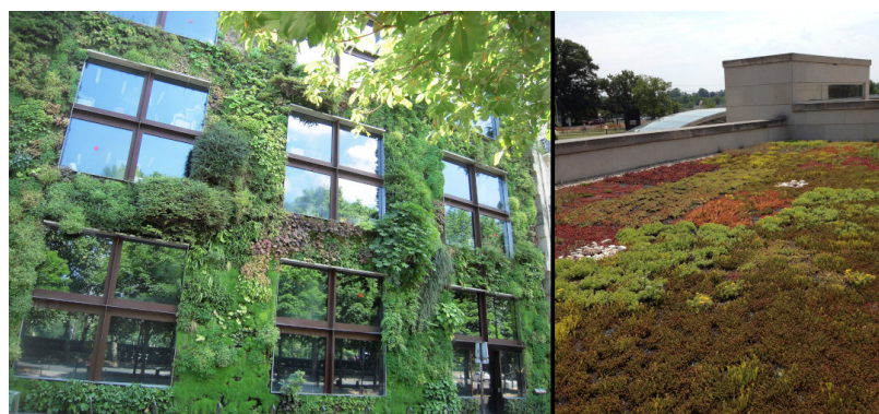
Figure 4. Green wall and roof.. A (left), Plant wall of the Musée du Quai Branly (Paris); [Source © Patrick Blanc (CC BY 2.0), via Flickr] ; B, (right) Green roof of a building on the NIH campus (Bethesda, Maryland, USA) [Source © Djembayz (CC BY-SA 3.0), via Wikimedia Commons].

One of the characteristics of urban biodiversity is that it is composed of a large proportion of cultivated or domestic species. For the flora, we think of all the horticultural or vegetable species that populate houses, balconies, public and private gardens, flower beds in the streets... Several hundred species are mobilized to accompany us. Among the cultivated flora are species on the ground, on walls and on roofs and terraces (Figure 4). Due to the characteristics of these different structures, the plant communities are not identical: on the walls grow mainly plants that like shade and humidity. On roofs and terraces, it is the plants in upland areas that are most enjoyable.