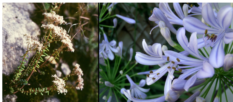
Figure 5. A (left), White Stone Plant ; B (right), Agapanthus flower.

Species come from a variety of geographical regions. Some are local, they have been part of the flora of our country for several hundred years, white stoneware ( Sedum album L.) for example is used to green some roofs (Figure 5). Many others are exotic. The agapanthus ( Agapanthus praecox Willd.), for example, which flowers nicely in many gardens, comes from South Africa (Figure 5).