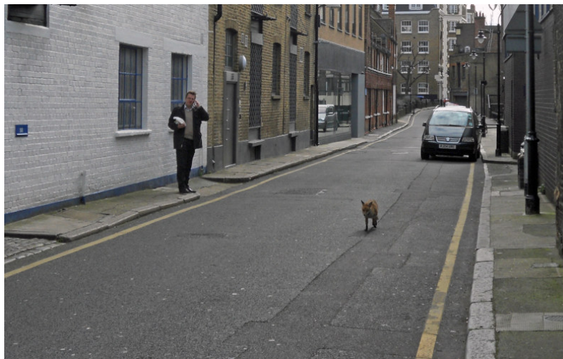
Figure 9. Fox on Ayres Street, Southwark (London borough).

As far as urban mammals are concerned, there are only about ten species. In our highly urbanised European cities, the last references to large mammals, carnivores or herbivores, wolves, deer, etc. date back several centuries, even if wild boars are increasingly reported in some outlying districts. Hedgehogs, moles, martens, squirrels, rats and mice, rabbits or foxes (Figure 9) and some species of bats are about the only mammals found in urban centres. While most thrive thanks to a very adapted lifestyle (prolific reproduction, night life...), others suffer from too difficult conditions. Hedgehogs in particular are in sharp decline due to the increasing scarcity of insect or gastropod species on which they feed, killed by insecticides or slug pellets. Fencing between gardens in increasingly large urban areas that prevent genetic exchanges between populations, as well as deadly encounters with vehicles on the road, make them a highly threatened species.