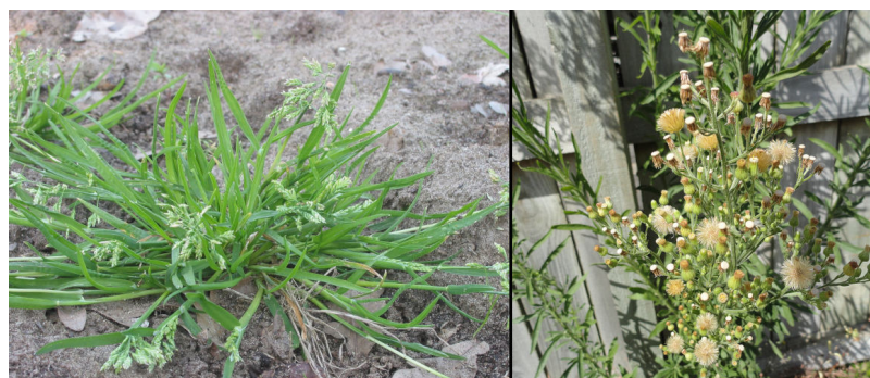
Figure 7. A, Annual bluegrass plant; B, Canada fleabane plant.

Wild plant species are quite few wild plant species. The richness of natural communities depends on the diversity of the spaces that make up the urban ecosystem because each type of environment, which corresponds to a type of use, has its own set of species: lawns, wastelands, vegetable gardens, etc. Depending on management practices, we can move from grass to lawn,