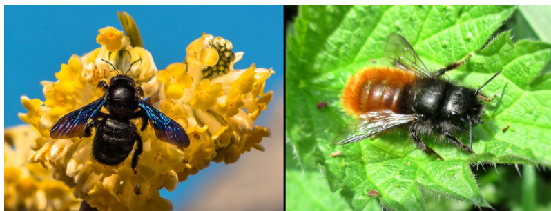
Figure 10. Lonely bee species. A, Carpenter bee, Xylocopa violacea ; B, Horned osmie, Osmia cornuta.

As far as urban mammals are concerned, there are only about ten species. In our highly urbanised European cities, the last references to large mammals, carnivores or herbivores, wolves, deer, etc. date back several centuries, even if wild boars are increasingly reported in some outlying districts. Hedgehogs, moles, martens, squirrels, rats and mice, rabbits or foxes (Figure 9) and some species of bats are about the only mammals found in urban centres. While most thrive thanks to a very adapted lifestyle (prolific reproduction, night life...), others suffer from too difficult conditions. Hedgehogs in particular are in sharp decline due to the increasing scarcity of insect or gastropod species on which they feed, killed by insecticides or slug pellets. Fencing between gardens in increasingly large urban areas that prevent genetic exchanges between populations, as well as deadly encounters with vehicles on the road, make them a highly threatened species.