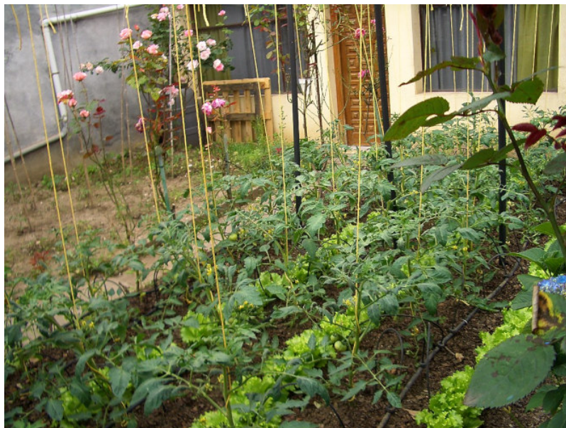
Figure 3. Apartment with flower and vegetable garden, in the city centre of Aretxabaleta (Spain).

Urban biodiversity also has cultural and educational virtues. It provides an opportunity to raise awareness of environmental issues among a wide audience, starting with children. A large proportion of small urban dwellers are in contact with nature only in the areas around their homes. The growing interest in associative initiatives whose objective is to show the nature of cities (nature festivals and other events around biodiversity for example) or the success of certain participatory science programmes (see focus on Participatory sciences ) whose objective is to collect data on the functioning of biodiversity in cities ( Sauvage de ma rue [2], Lichen go [3], garden biodiversity...) demonstrates the importance in preserving green spaces in the most central districts.