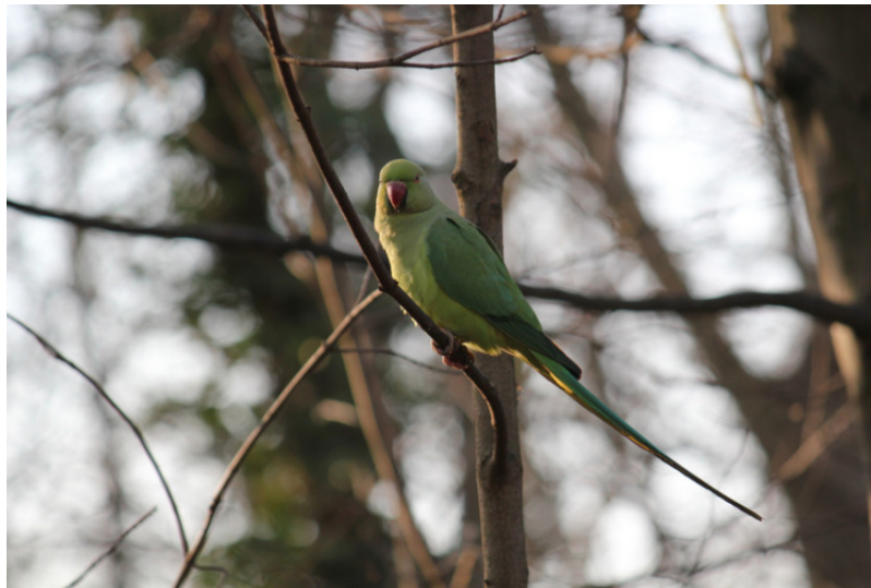
Figure 8. Necklace parakeet in the Parc de Sceaux (Paris).

The most threatened are wetland plants that have been largely drained during the urbanization phases. Some ferns in particular are protected because they are becoming scarce in the city.