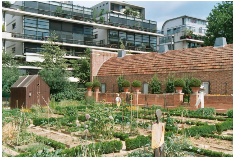
Figure 11. Garden in Bercy Park (Paris)

dangerous to the health of urban dwellers. Mowing and pulling up must be spaced out over time to allow the species to complete their life cycle.