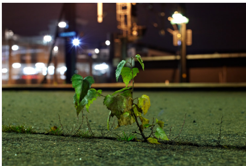
Figure 2. Plant (young birch) growing in the crevice of a street surface.

Another particularity of the urban environment is its artificial microclimate, which is warmer and drier than its surrounding areas. This phenomenon called "urban heat island" (Figure 1) is due to human activities concentrated in cities, some of which produce a lot of heat, such as factories, vehicle engines, building heating, air conditioning, hot water circulating in sewers, etc. It is also the result of waterproofing urban soils that absorb solar radiation and then return it as heat, something that plant covered soils do not do.