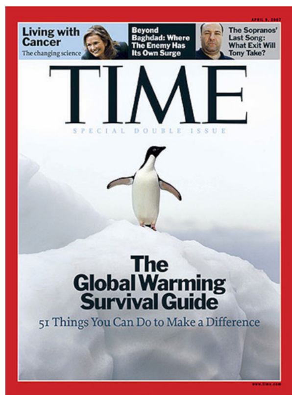
Figure 6. Cover of the "Time" of April 9, 2007, "The Global Warming survival guide".

At the same time, however, another debate was beginning to take shape in the scientific world. Researchers are beginning to warn of the potential dangers of CO 2 emissions : for example, Germany's Hermann Flohn [22] or Sweden's Bert Bolin. Others remain even more nuanced. In 1973, in the television program Les dossiers de l'écran , Claude Lorius, a French pioneer in polar ice, agreed to discuss the "possibility of a change of 2 to 3° centigrade due to CO 2 . There are many people who think it is overrated. But when he talks about the 20 billion tonnes of CO 2 released into the atmosphere, his opponent, Commander Cousteau, reacts: "Oh, this is bullshit... People are starting to break my ears with this CO 2 thing. There are much more serious risks that are slag rains" [23].