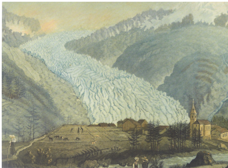
Figure 3. "View of the glacier and the Argentière needle in the Chamounis valley", Colourful engraving by Samuel Grundmann from the early 19th century.

A privileged field of observation, the considerable advance of glaciers during the Little Ice Age does not encourage observers to consider any climate change either. A particularly attentive observer of the upheavals that occurred in the Pyrenees and then in the Alps, Ramond de Carbonnières concludes that there is a physical cause (the accumulation of ice in high altitude areas and a gravitational phenomenon) to explain the advance of glaciers in the lower valleys: "I will not say that their increase is due to the cooling of the globe," he emphasizes, adding pessimistically: "It must be admitted, however sad this truth may be, that ice tends to cover the entire surface of the high Alps, and to isolate the more temperate valleys they contain [14] . "For contemporaries of the "Little Ice Age", the advance of glaciers bears no evidence of climatic cooling, but only confirms the hypothesis of a constant accumulation of ice in the coldest parts of the mountains since the beginning of the Earth's formation (see Mountain glaciers, sentinels of climate change ). The idea is widely shared. For César Bordier, they slide "like softened beeswax". Saussure doesn't really say anything else.