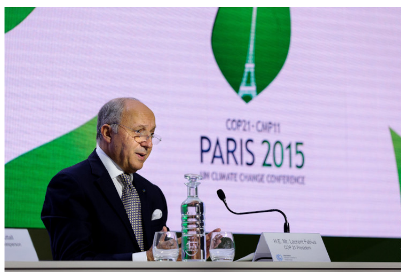
Figure 7. Laurent Fabius, President of COP 21, 7 December 2015.[ Source Photo COP PARIS, via Flickr, public domain].

Gradually, the media took over the issue . In France, the magazine Géo published in October 1984 "La Terre se réchauffe", but the main article still has a question mark: "Does the planet of men burn? "Ultimately," concludes the author of the article, "there is no evidence that the planet's climate today is due to these natural fluctuations, which may only be the distant aftermath of the last deglaciation, oscillations around a new equilibrium point. If we have any difficulty in perceiving it in this way, it is simply because, in view of geological time, human life is decidedly too short. In 1988, Newsweek was more positive: "Greenhouse effect. Danger. No more hot summers in sight. "The Global Warming. Survival Guide: 51 Things you can do make a Difference" title for its part Time in April 2009.