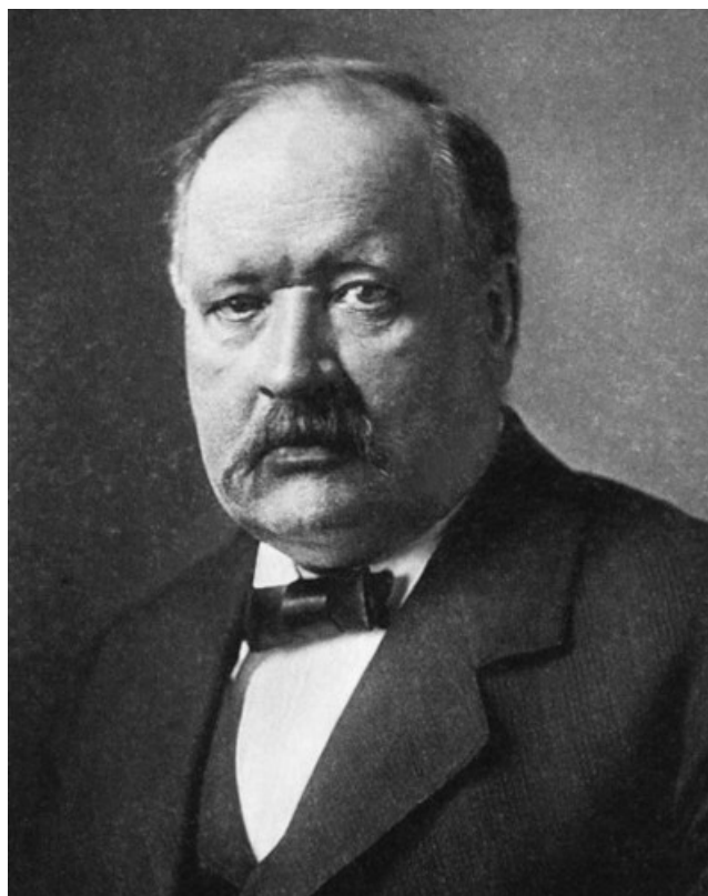
Figure 5. Portrait of Svante Arrhenius.

Although Fourier's data did not allow him to quantify this "greenhouse effect", the work of geologists and physicists gradually confirmed the reality of the historicity of the climate in the 19th century. In the early 1830s, Charles Lyell's work on geological layers confirmed the hypotheses about the Earth's very long history. In the 1850s, Lord Kelvin developed his research on cooling based on the work of Joseph Fourier. However, he concludes that the Earth's history is 10 to 20 million years old, incompatible with the geological data developed by Lyell. It was not until the 20th century that nuclear physics made it possible to report geological observations and establish its age in billions of years. On another level, in 1873, the Irish John Tyndall made a decisive contribution to the issue of glacier flow.